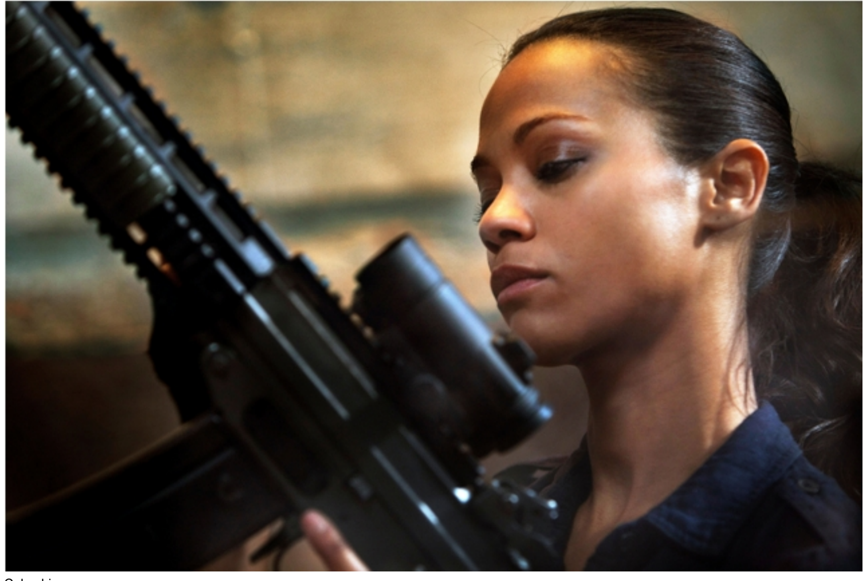
Colombiana

"Colombiana" opens with a scene of extreme violence that should have warranted the push from PG-13 to R that never happened. (Maybe the MPAA fell asleep or decided not to screen the film. It's hard to blame them. But you should be warned that this is the most-violent PG-13 of the year. One man is eaten alive by sharks and dozens are gunned down.) A little girl named Cataleya watches her father and mother get gunned down at the orders of a ruthless drug lord. She escapes with some vital information and uses it to talk the American Embassy into allowing her passage from Bogota all the way to Chicago. Yes, it's another film set in our wonderful hometown that doesn't use it to any advantage at all.