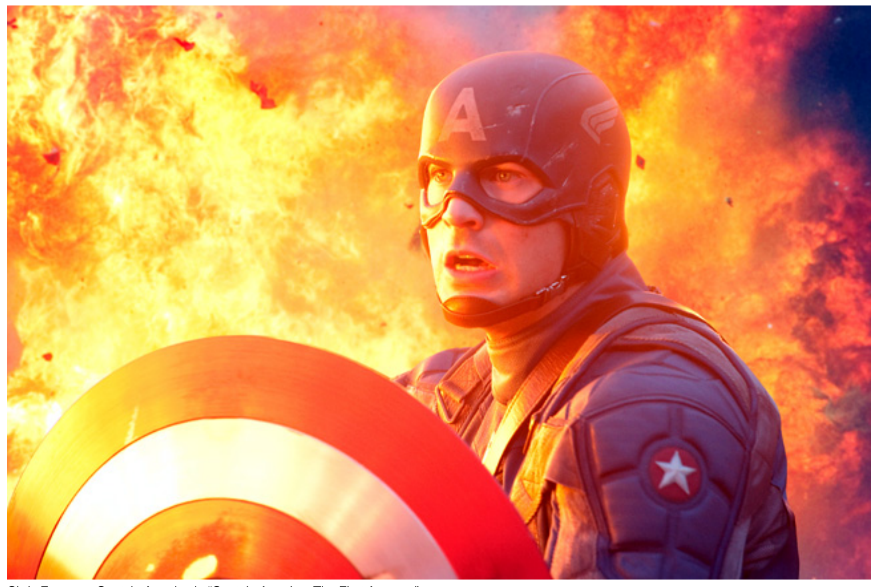
Chris Evans as Captain America in "Captain America: The First Avenger".

And while "Captain America: The First Avenger" unsurprisingly doesn't disappoint in that easily impressive department, the film ultimately succeeds where most comic book adaptations fail: a love connection you actually feel, a mostly cohesive story and a believable superhero who manages to inspire all without being too unrealistic.