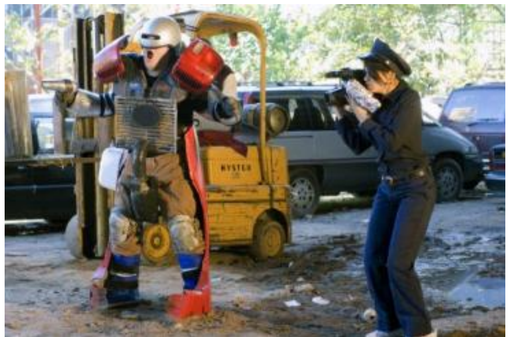
Jack Black (left) and Melonie Diaz in "Be Kind Rewind".

His outlandish idiosyncrasies mesh with the even-more-improbable storyline and Mike compliments Jerry through his levelheaded and patient tendencies. Performances by Mia Farrow, Danny Glover and Sigourney Weaver bring balance to the overly energetic filmmakers and frame the story with a traditional start-to-finish plotline.