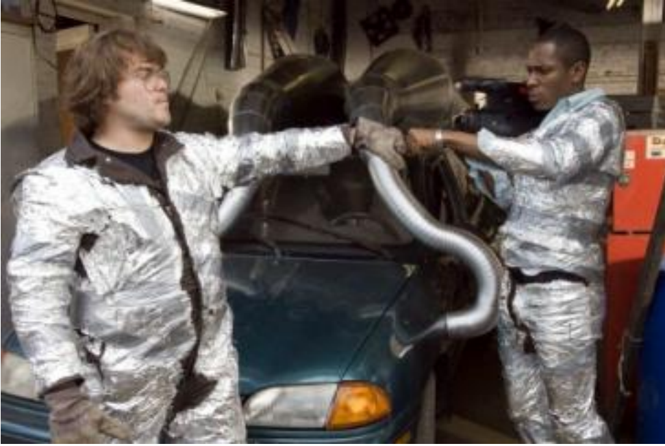
Jack Black (left) and Mos Def in "Be Kind Rewind".