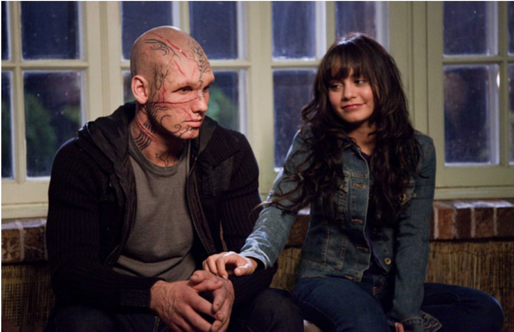
Relatable? Alex Pettyfer (Kyle the Beast) and Vanessa Hudgens (Lindy) in 'Beastly'

This is apparently based on a novel, geared to the young adult "Twilight" saga crowd. All the ancient monsters like vampires, werewolves and beasts are becoming best seller primed for text messaging, set-in-high-school reworks. Next on the docket, "Firebreath, Confessions of a Teenage Dragon."