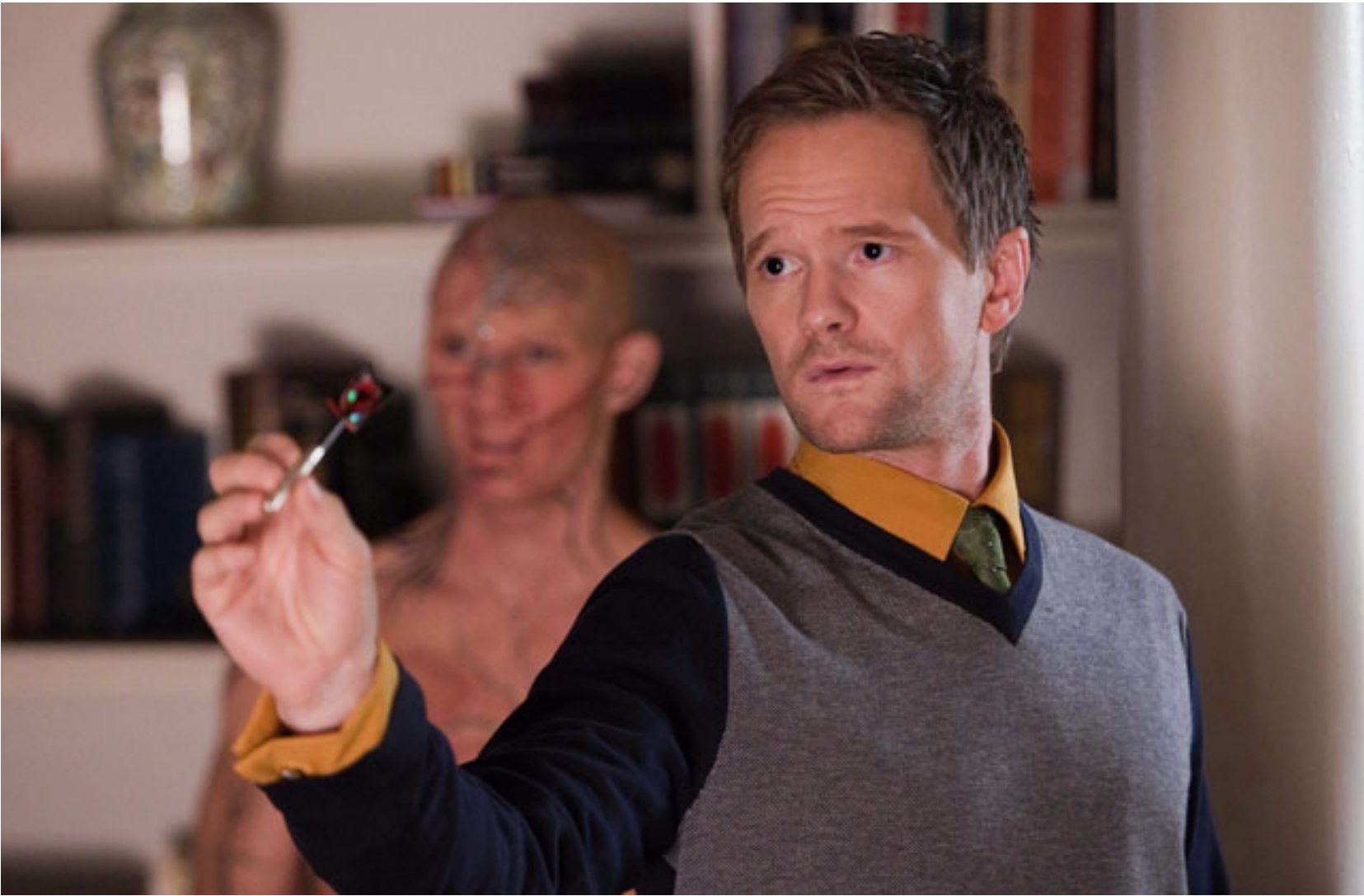
Bullseyed: Neil Patrick Harris is Will the Tutor in 'Beastly'

It is Lindy that still holds sway for the Beast, and he begins a campaign to woo her, or in his case stalk her. After some unlikely circumstances, Lindy moves in with the Kyle's new family, housekeeper Zola (Lisa Gay Hamilton), Will and his Beastly self. Can he find the true love to break the spell? What, you've never heard of this story before?