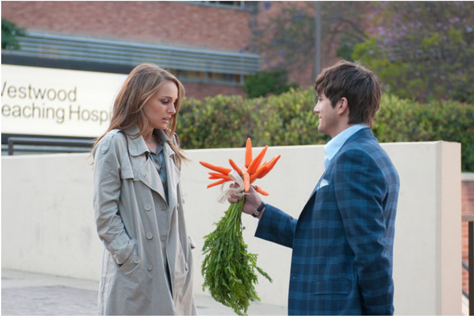
Let Us Be Lovers?: Natalie Portman (Emma) and Ashton Kutcher (Adam) in 'No Strings Attached'

That is until Vanessa separates from Adam to take up with his father (Kevin Kline), a foppish ex-sitcom star living off the fame of his big hit series, "Great Scott." This development puts Adam into a tailspin, and he ends up drunk and nude (who doesn't?) on the couch of Emma and her doctor roommates. This is where the first tryst takes place, and where Emma gets the idea that she and Adam will be Schtup Buddies. Where will they go from there?