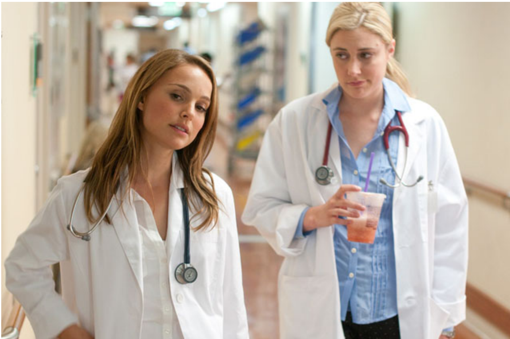
Paging Dr. Love: Natalie Portman takes advice from Greta Gerwig (Patrice) in 'No Strings Attached'

With Valentine's Day around the corner, No Strings Attached gets out of the gate early and may even win the battle in the expected tournament of romantic films. It has a funny sensibility and even manages a few highly swooning lines from the lovely and youngish (but watch out for the close-ups) Mr. Demi Moore.