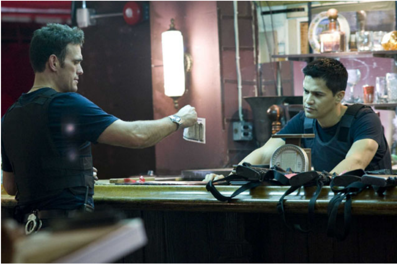
Police Squad: Matt Dillon and Jay Hernandez Are on the Case in 'Takers'

But some of the elements of the film were notable. The action sequences were shot with clarity, as well as the gang's expensive and expansive lifestyle. T.I. was having fun and the audience loved him – especially when he had to dress up like a cop during the main heist – and he seemed like the only gang member with a sense of the law on his tail. The final confrontation with the law between the two robber brothers (Ealy and Brown) had a Butch and Sundance quality to it, with an out-of-focus perspective that actually was poignant.