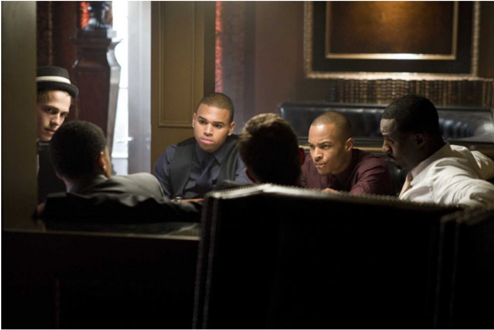
The Gang's All Here: Hayden Christensen, Chris Brown, T.I. and Idris Elba Make the Plan in 'Takers'

Further complicating the circumstance is Gordon's sister Naomi (Marianne Jean-Baptiste), just out of rehab and looking to her brother to stay clean. Also Jake (Michael Ealy) has just got engaged to Rachel (Zoe Saldana) and conveys a mistrust of the Ghost that may turn out to be intuitively true. As the clock ticks away toward the biggest heist in their careers, will the Takers be able to hold it together?