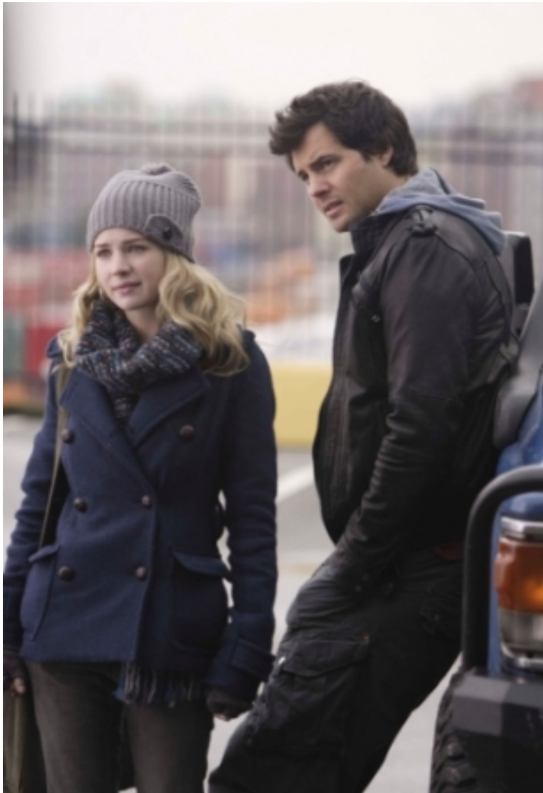
Life Unexpected

As she is about to turn 16, Lux wants to be emancipated from the foster care system but she needs the signatures of her biological parents to do so. This leads her to the doorstep of father Nate (Kristoffer Polaha), something of a slacker who didn't even know that the girl he knocked up back on the night of their high school winter formal kept the baby.