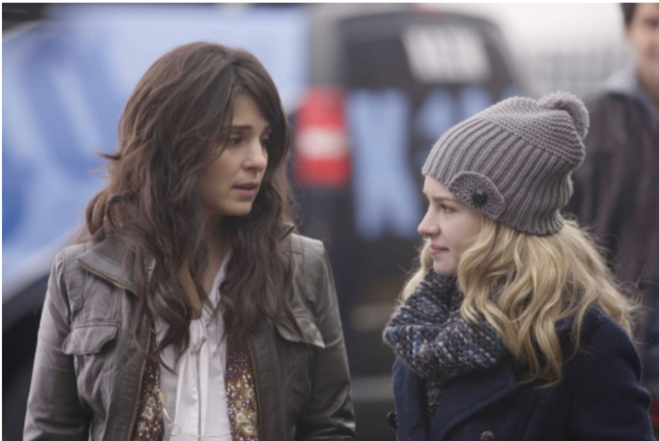
Life Unexpected

The fact is that genuine, heartfelt characters have become hard to find on the youth-driven network. Shows either feature cartoonish, soap opera caricatures like those on “90210,” “Gossip Girl,” or “Melrose Place” or come with a hook like “Smallville” or “Supernatural”. The new drama, “Life Unexpected” harkens back to the days of programs like “Gilmore Girls” and “Everwood,” when character not hook was the number one focus.