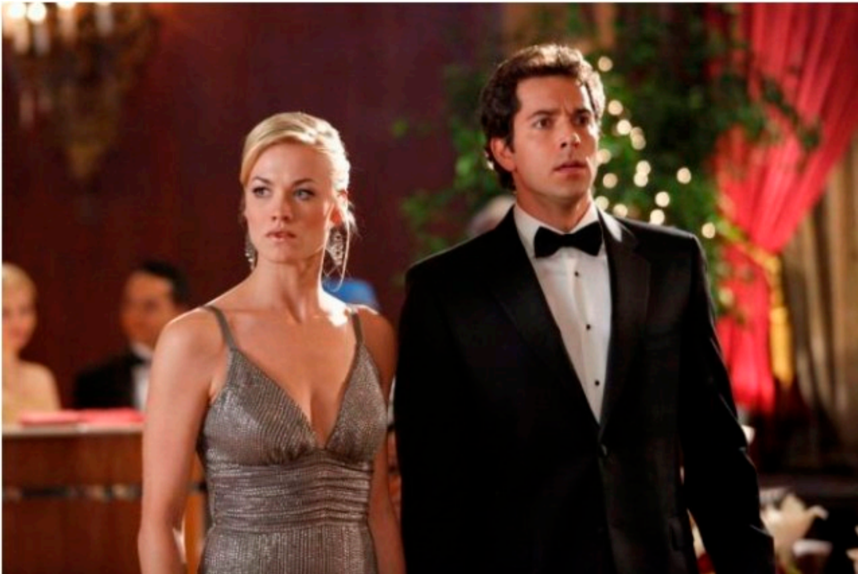
Chuck vs. the Angel de la Muerte Episode 303 — Pictured: (l-r) Yvonne Strahovski as Sarah Walker, Zach Levi as Chuck Bartowski

The second of “Chuck,” recently released on DVD (which we’ll get into in more detail later), felt a bit like a show spinning its wheels. The series failed to pick up any new fans and lost a few, although I imagine a number of “Chuck” fans are watching in that space that doesn’t get reflected in ratings - On Demand, online, etc. No matter the reason for the ratings slide, “Chuck” needs to grab fans quickly with the third season or there very likely won’t be a fourth.