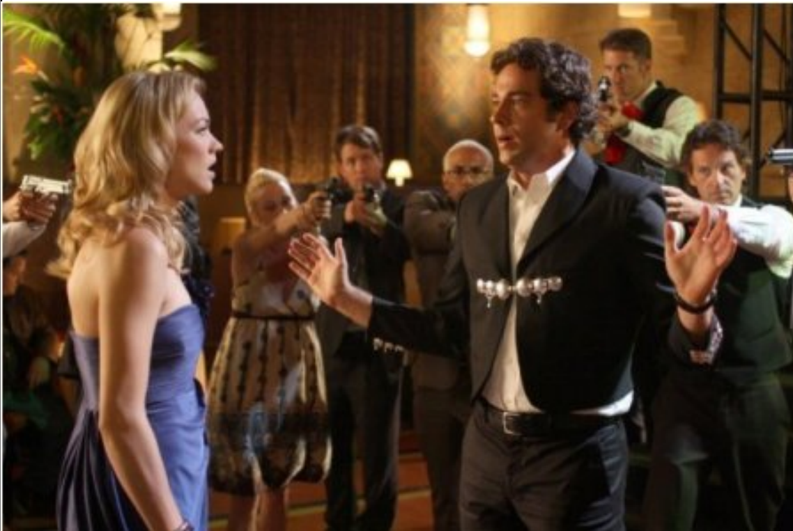
Chuck vs. the Pink Slip Episode 301— Pictured: (l-r) Yvonne Strahovski as Sarah Walker, Zach Levi as Chuck Bartowski

In a very smart move, “Chuck” has undergone something of a reboot in an attempt to find a wider audience although it’s by no means a sell-out of the original concept of the show. Chuck Bartowski (Zachary Levi) is no longer just a nerd with a database of spy information inside his head - he’s a deadly nerd with a database of spy information inside his head.