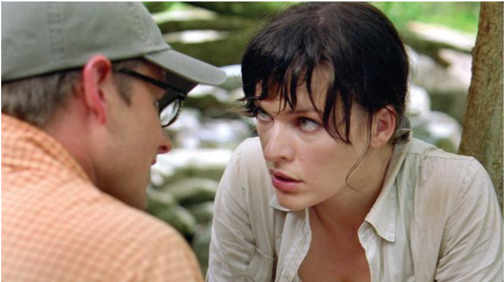
A Perfect Getaway was released on Blu-Ray and DVD on December 29th, 2009.

“A Perfect Getaway” opens with home video footage shot at a wedding and then cuts to Cliff & Cydney Anderson (Zahn & Jovovich), a young couple on their honeymoon on the beautiful island of Kaua’i. All smiles as they drive a keep through the brush and take a helicopter ride, the two plan a 3-day hike to a beach that can only be reached by foot or kayak.