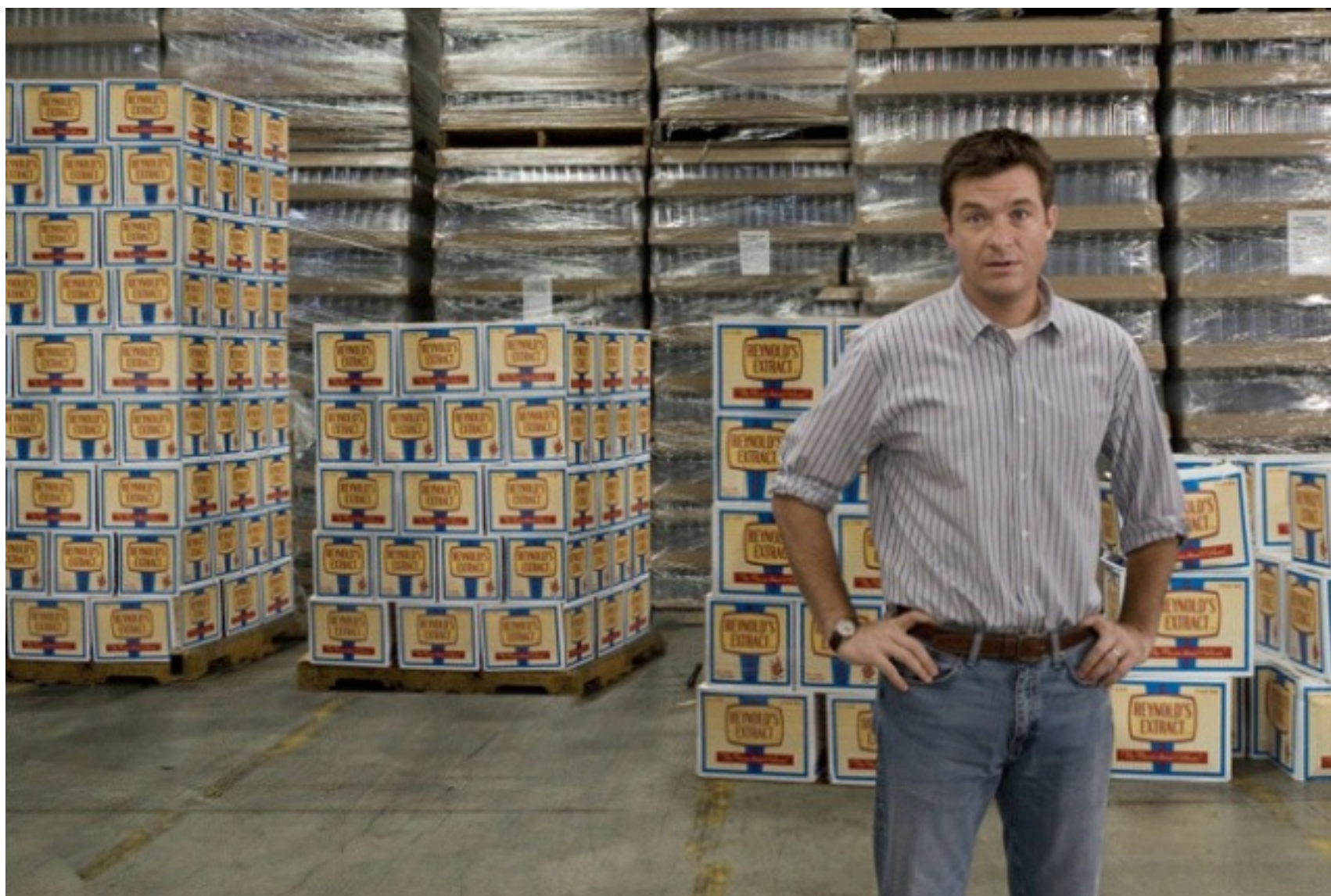
Jason Bateman stars in Mike Judge's Extract.

Since his star-making role in "Arrested Development," Bateman has mastered the art of remaining straight-faced and sane while treading water in a sea of morons. His deadpan comic timing keeps Judge's film grounded during its most looney passages, most of which are kick-started by Joel's ill-advised friendship with bartender Dean (Ben Affleck). When Joel becomes smitten with Cindy (posing as a temp), he seeks Dean's advice, while under the influence of a horse tranquilizer. The next morning, a sober and horrified Joel finds himself paying a gigolo to sleep with his wife, in order to erase his guilt for pursuing Cindy.