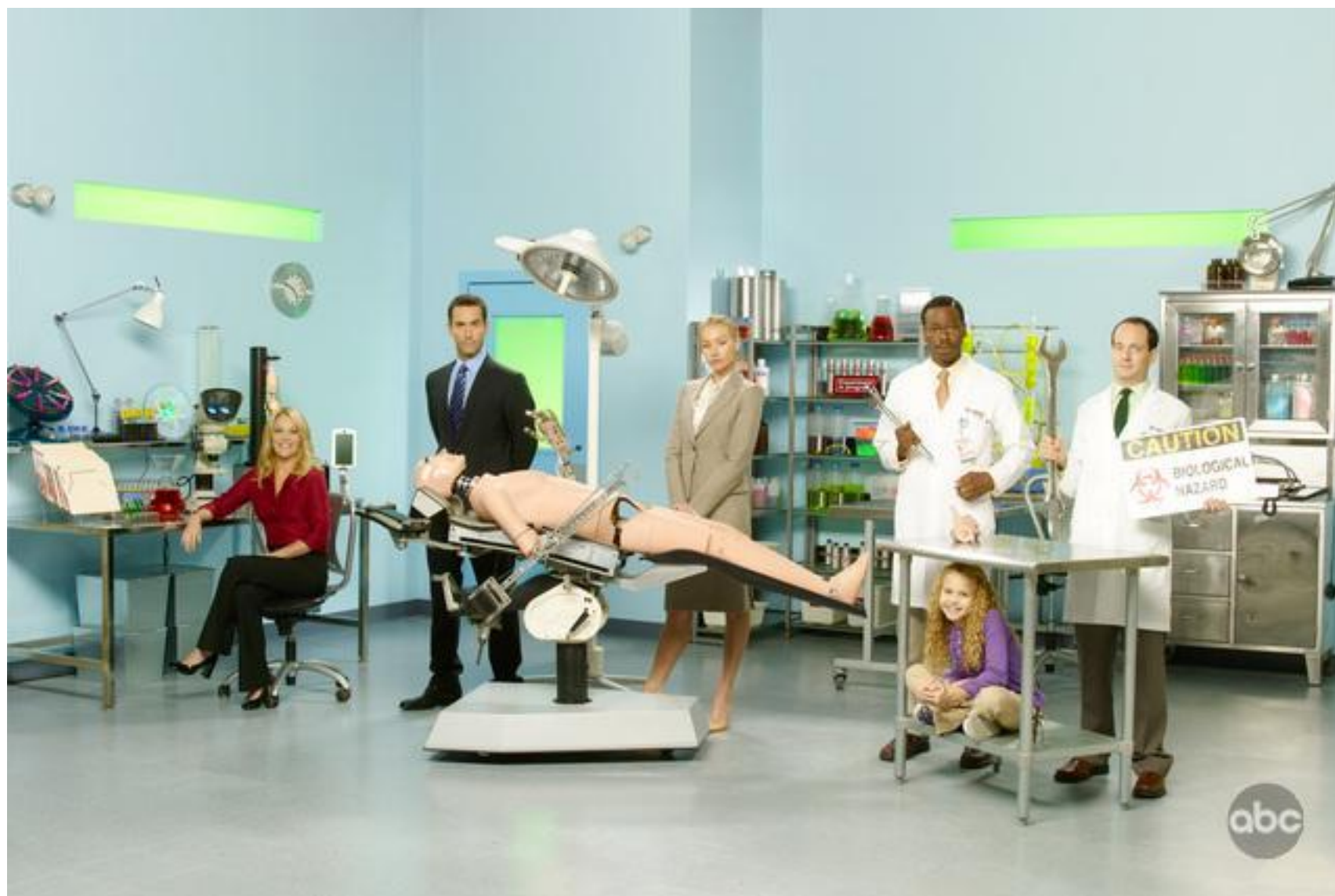
Andrea Anders, Jay Harrington, Portia De Rossi, Malcolm Barrett, Isabella Acres, Jonathan Slavin

With a second-season premiere tonight and the recent arrival of the first season on DVD, if “Better Off Ted” has a shot at even cult status, it better happen soon. The ratings near the end of last season were abysmal and I’ll admit that I had written off the show, somewhat surprised to see that it was returning (partnered again with “Scrubs” on Tuesday nights). With crisp writing and a stellar ensemble that improves episode by episode over the course of the first season and a strong season-two premiere, “Better Off Ted” deserves the second chance ABC has given it. “Castle” struggled in season one but has developed a following after being given a second chance. You never know what could happen to “Ted”.