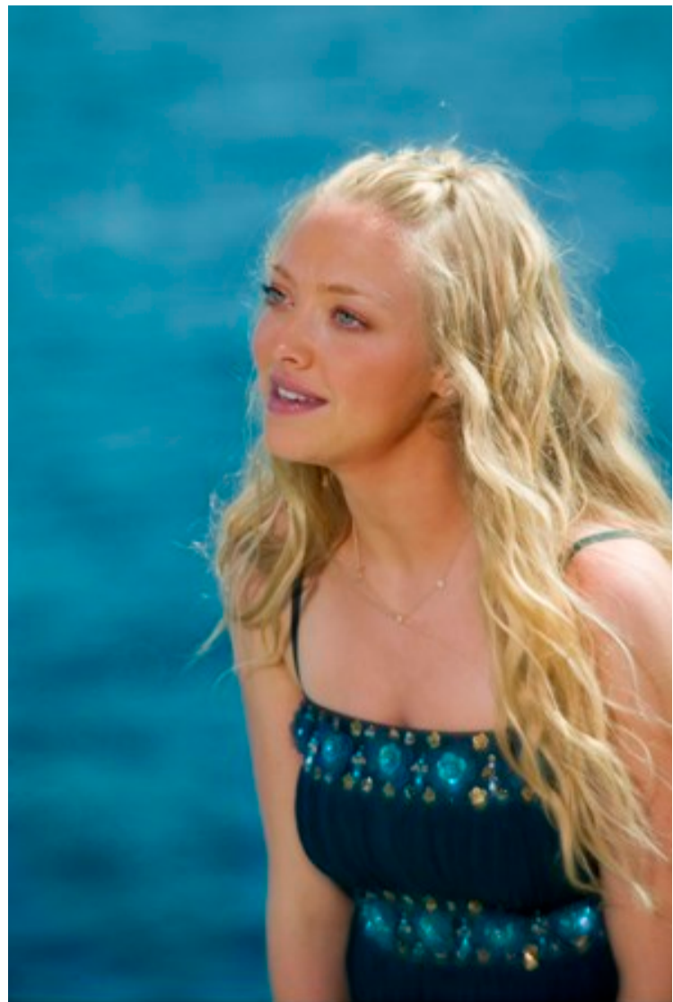
Mamma Mia! The Movie: The Gimme! Gimme! Gimme! More Gift Set" was released on Blu-Ray and DVD on November 10th, 2009.