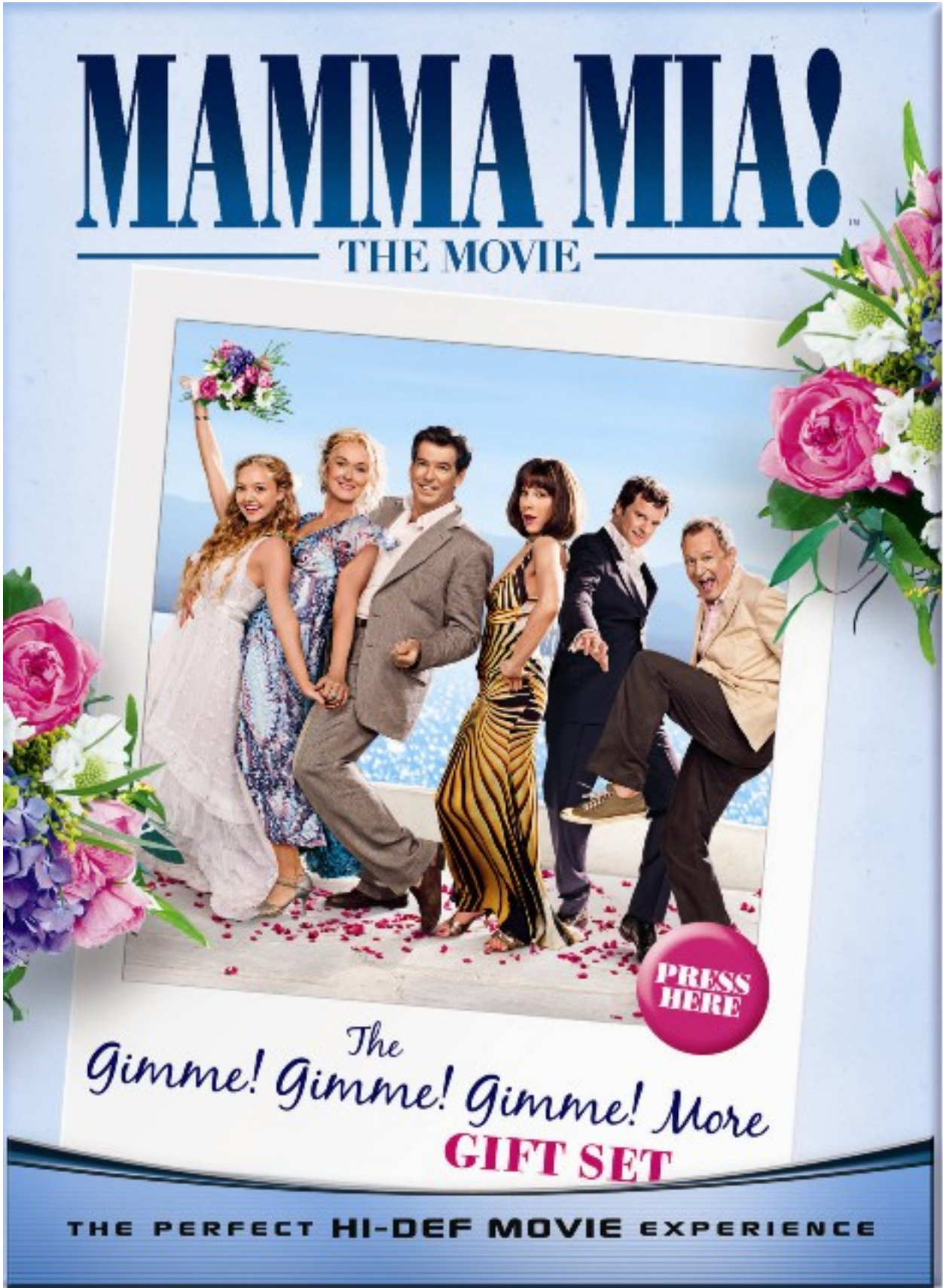
Mamma Mia! The Movie: The Gimme! Gimme! Gimme! More Gift Set" was released on Blu-Ray and DVD on November 10th, 2009.

Sadly, the producers of "Mamma Mia! The Movie - The Gimme! Gimme! Gimme! More Gift Set" play it shockingly safe, essentially just packaging the already-released Blu-Ray, without a single new special feature, with the already-released soundtrack and throwing in a goofy book and an extra-large package to make it look more impressive. If you already own "Mamma Mia!," isn't it likely that you already own the soundtrack? And there's absolutely no justification in picking up a set with this price point just for a collectible book.