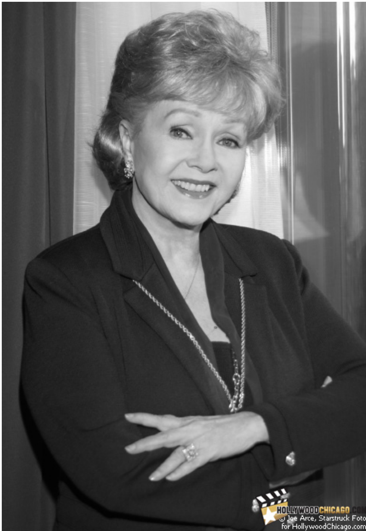
She is Our Lucky Star: Debbie Reynolds in Chicago, November 6th, 2009

HollywoodChicago caught up with the legendary star as she made an appearance at the Hollywood Palms in Naperville, Illinois, introducing Singin' in the Rain and The Unsinkable Molly Brown . She spoke candidly about the films, the husbands and the litany of family secrets through the filter of daughter Carrie Fisher.