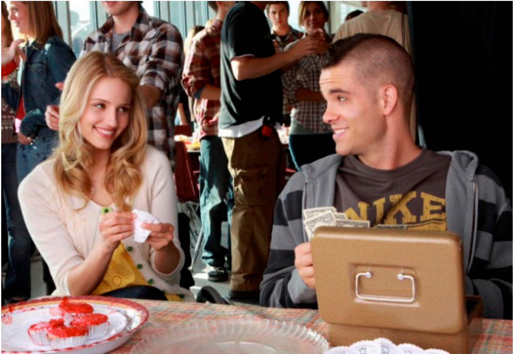
Quinn (Dianna Agron, L) and Puck (Mark Salling, R) work at the Glee Club's bake sale in the "Wheels" episode of GLEE airing Wednesday, Nov. 11 (9:00-10:00 PM ET/PT) on FOX.

Tonight's episode, "Wheels," displays how - by diversifying the focus of the show and providing depth to even the most supporting characters. The moments that stand out in the first arc of "Glee" episodes are the unexpected ones - Kurt (Chris Colfer) using "Single Ladies" on the football field, Rachel belting out a moving version of "Take a Bow," the entirety of Kristen Chenoweth's amazing guest turn on "The Rhodes Not Taken," the best episode of the show to date.