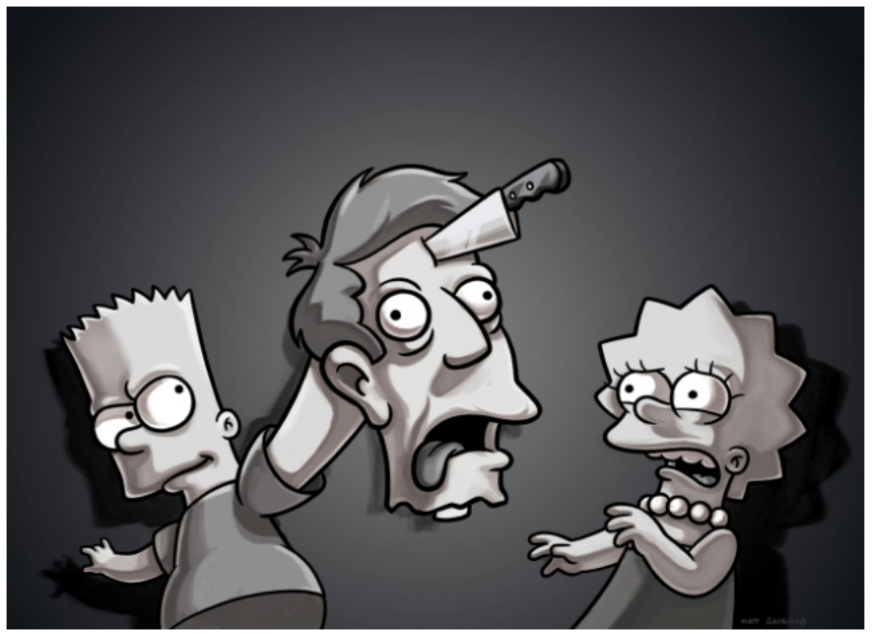
In the 20th anniversary of THE SIMPSONS annual "Treehouse of Horror" Halloween special, Lisa strikes a deal with Bart to seek revenge on their teachers in a series of homages to classic Hitchcock, in "Treehouse of Horror XX" airing Sunday, Oct. 18 (8:00-8:30 PM ET/ PT) on FOX.

For years, starting around season twelve (and that may be generous), "Simpsons" fans like myself used to fall back on a crutch that went something like "Even sub-par "The Simpsons" is better than most TV." Sure, we knew that the writing wasn't nearly as clever or consistent as it used to be, but the show still had laugh-out-loud moments and was certainly more entertaining than most horrible sitcoms on the broadcast TV schedule. Even that flimsy defense of the show has started to ring false and this year's "Treehouse of Horror" is a perfect example of why the show is starting to resemble an athlete way past his prime but still suiting up every week. We all hope for one more comeback. This season's "Treehouse" is not that comeback.