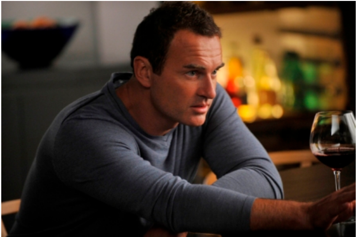
Nip/Tuck.

And that’s the problem with season six of “Nip/Tuck”. It’s hard to care any more when it feels like the writers don’t either. Maybe Ryan Murphy is too busy devoting his creative energy to the far superior “Glee,” but “Nip/Tuck” has lost the creative spark, going for controversial instead of original. When a blind man asks Christian to masturbate and describe it to him, the scene doesn’t have the soap opera jolt that it would have in earlier seasons. We’ve been down wackier roads before with “Nip/Tuck”. The writers need to either bring this series back to its more dramatic roots or let it completely fly off the rails in a feast of over-the-top insanity in the last nine episodes.