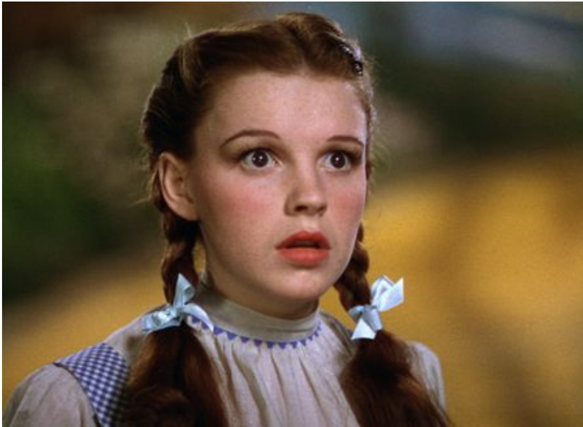
The Wizard of Oz: 70th Anniversary Ultimate Collector's Edition was released on DVD and Blu-Ray on September 29th, 2009.