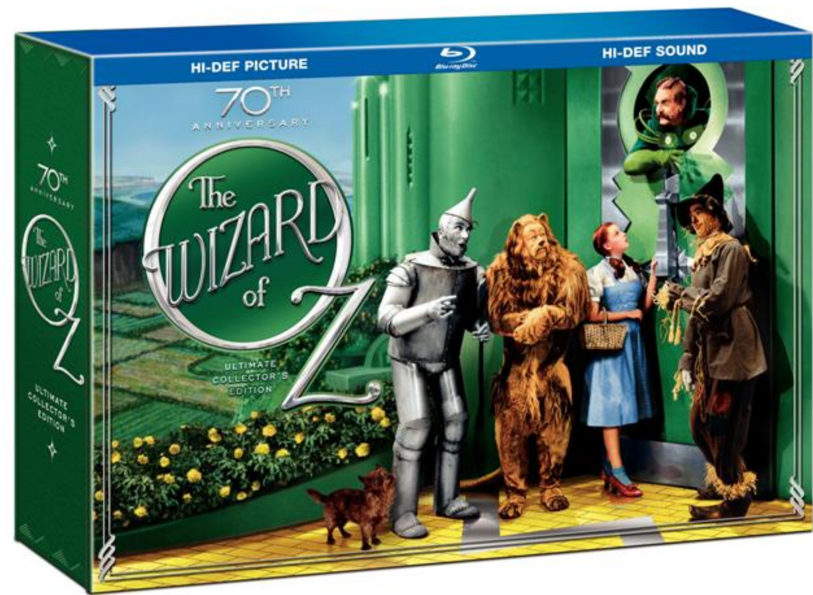
The Wizard of Oz: 70th Anniversary Ultimate Collector’s Edition was released on DVD and Blu-Ray on September 29th, 2009.

As for the film itself, what more could possibly be written about “The Wizard of Oz”? By some standards, it’s the most watched movie in world history, a film that has transcended its genre to simply become a part of the history of the planet. Have you ever heard someone criticize or complain about “The Wizard of Oz”? Me either.