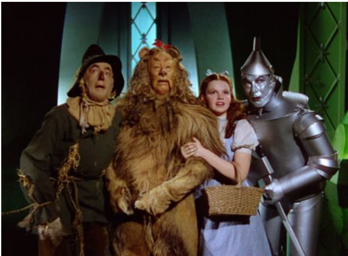
The Wizard of Oz: 70th Anniversary Ultimate Collector's Edition was released on DVD and Blu-Ray on September 29th, 2009.

Before a buyer of the "UCE" even gets to the film, they'll marvel at the gorgeous packaging and the collection of physical collectibles in the set, including a Limited Edition 70th Anniversary watch with genuine crystals, an original 1939 campaign book reproduction, a replica of the original movie budget, and a 52-page commemorative book called "Behind the Curtain of Production 1060".