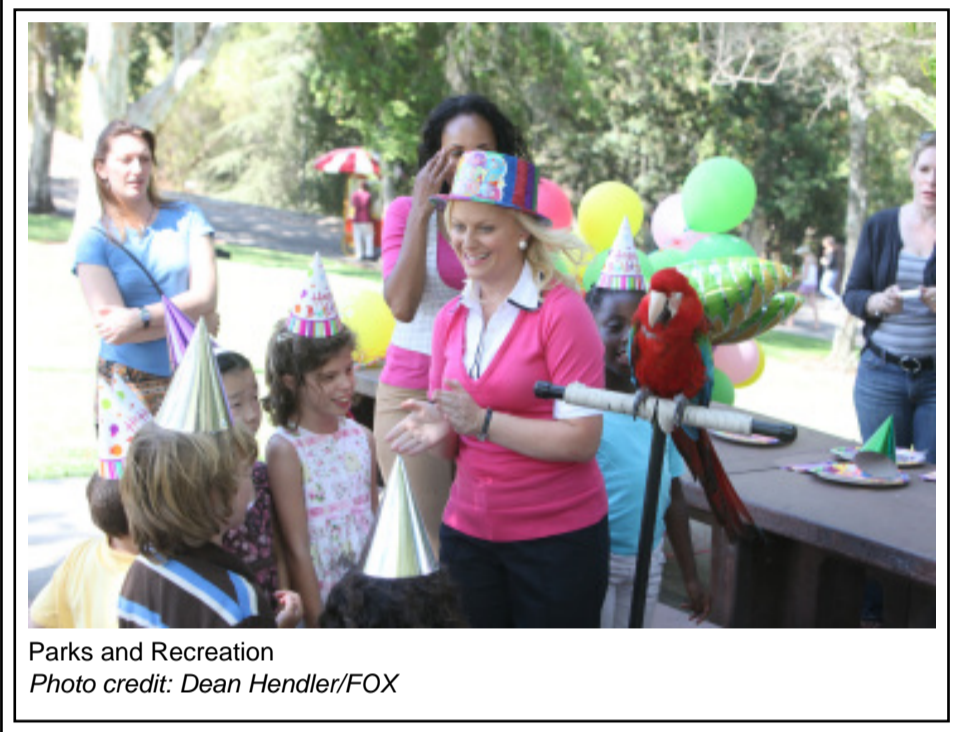
Parks and Recreation

"Parks and Recreation" features the same dry wit, workplace humor, and awkward pauses of "The Office," but it started to develop its own identity over the course of the first season and opens the second one truly feeling like its own series.