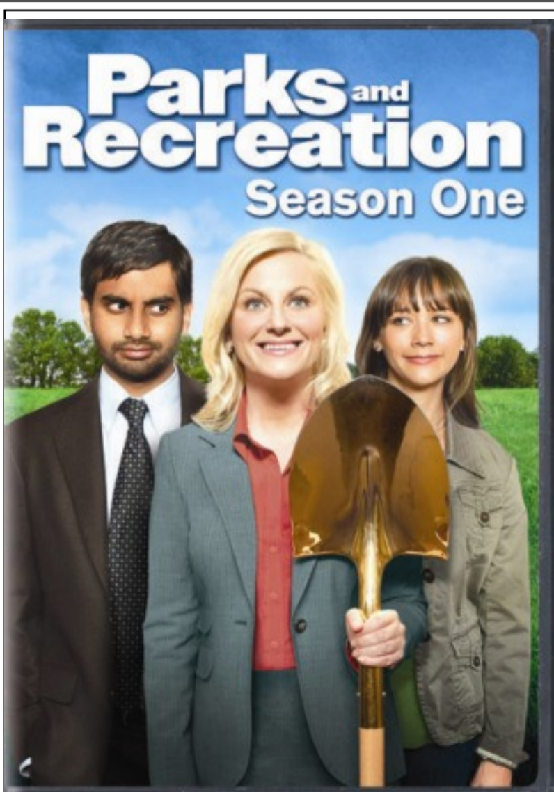
Parks and Recreation

Very few comedies come out of the gate without a few flaws. The first month of “30 Rock” didn’t have nearly the comic timing that made the third season an Emmy darling. It takes time to develop pacing, comic chemistry, and characters that the audience care about. Watching the first season of “Parks and Recreation,” you can see those essential ingredients start to click by roughly episode four, “Boys Club”.