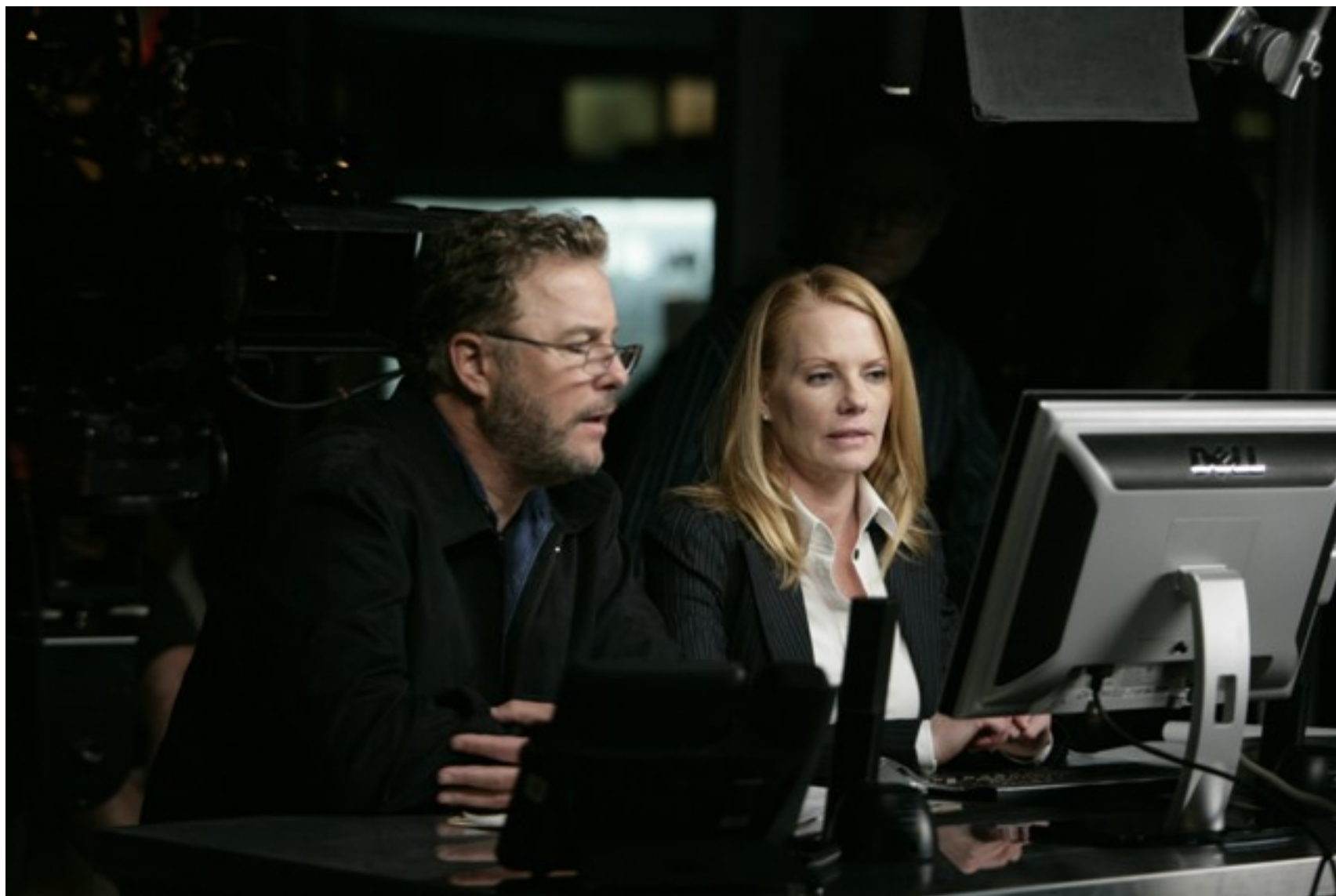
CSI: Crime Scene Investigation - The Ninth Season was released on Blu-Ray on September 1st, 2009.

With six discs, over 17 hours of murder mystery mayhem, and hours of special features, the ninth season of “CSI: Crime Scene Investigation” is a great Blu-Ray release to catch up before the tenth season of the flagship show of a franchise that shows few signs of slowing down.