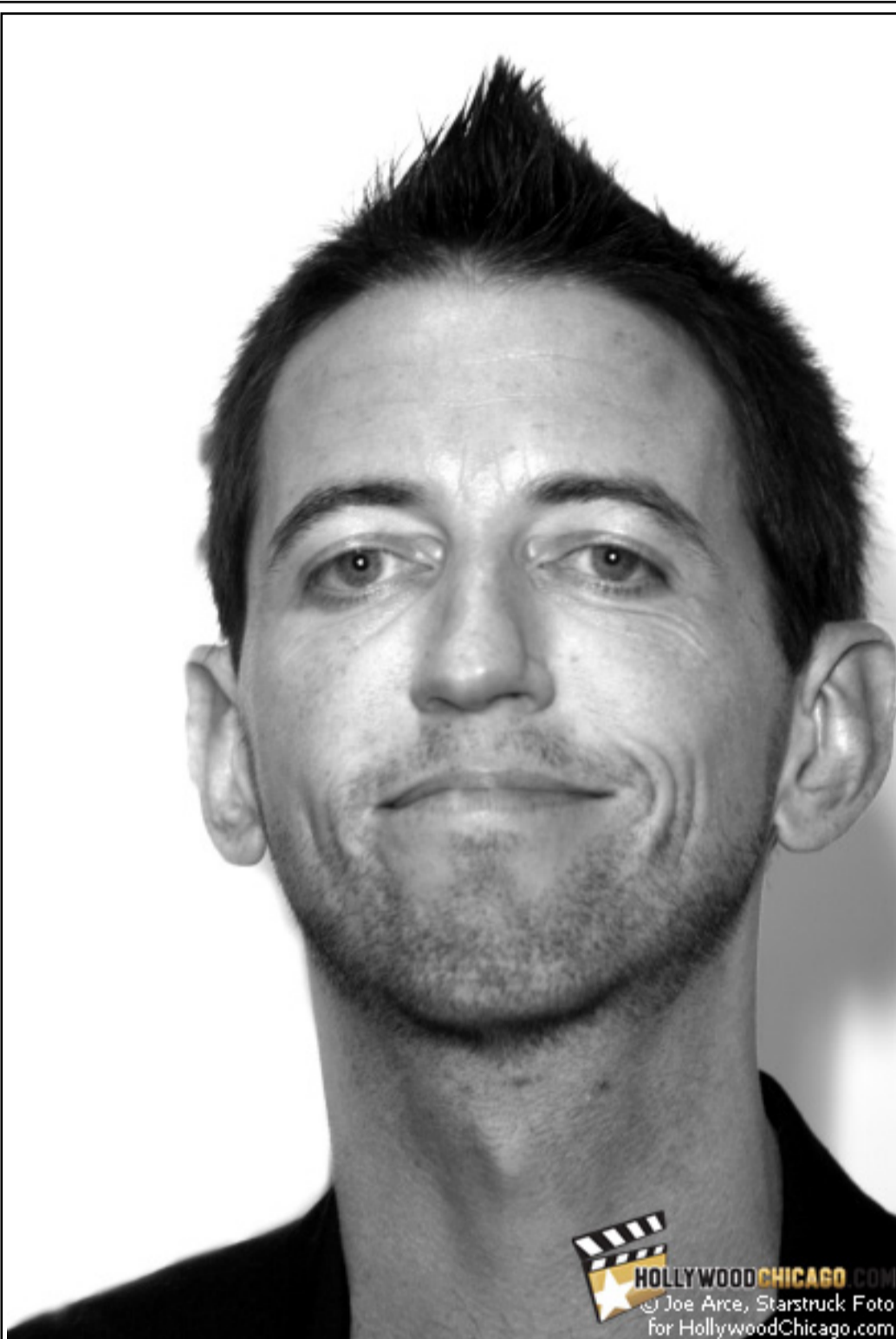
Neal Brennan at the Chicago Premiere of 'The Goods: Live Hard, Sell Hard' on August 13, 2009.

Screenwriter ("Half Baked") and a former comedy scribe for "Chappelle's Show," Neal Brennan makes his film directorial debut with The Goods.