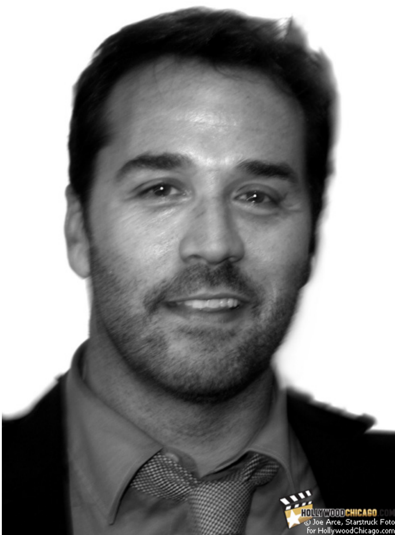
Jeremy Piven Walks the Red Carpet at the Chicago Premiere of 'The Goods: Live Hard, Sell Hard' on August 13, 2009.