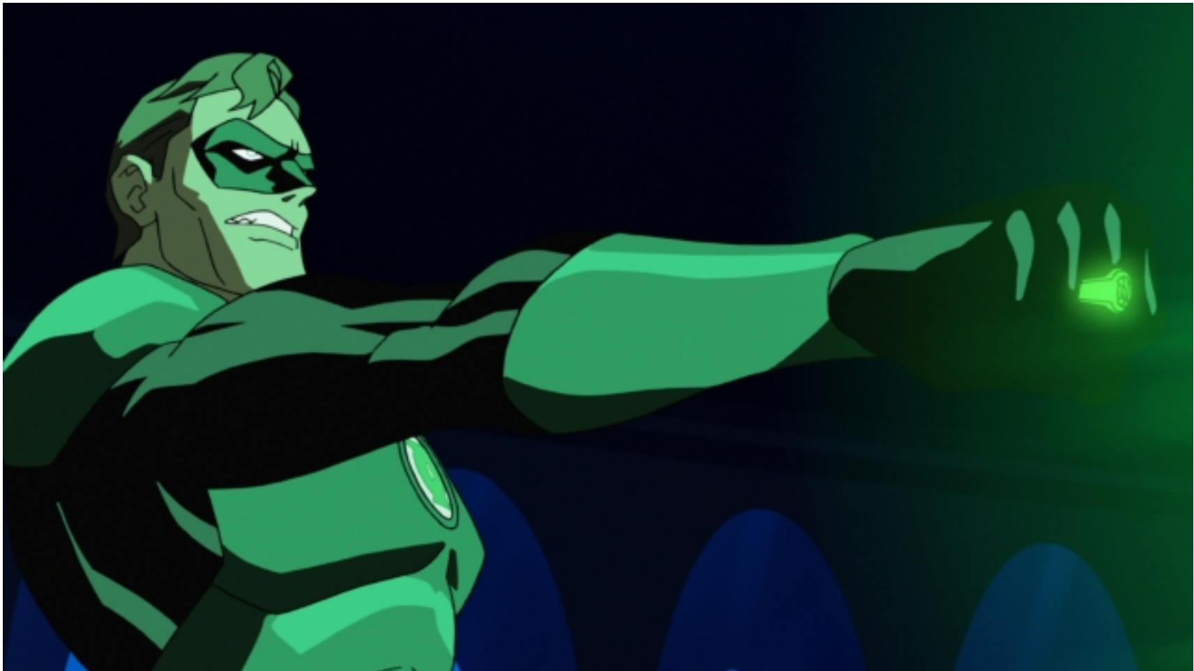
Green Lantern: First Flight was released on DVD on July 28th, 2009.

In 2007, Warner Brothers and DC started releasing a series of PG-13 animated, full-length feature films with a surprisingly artistically successful franchise of films. “Superman: Doomsday” started the line, followed by the excellent “Justice League: The New Frontier” (easily the best of the franchise to date) and very good “Batman: Gotham Knight” in 2008. This year has given us the so-so “Wonder Woman” and now the very disappointing “Green Lantern: First Flight,” a release that not only falls below the franchise standard in film quality but DVD presentation as well.