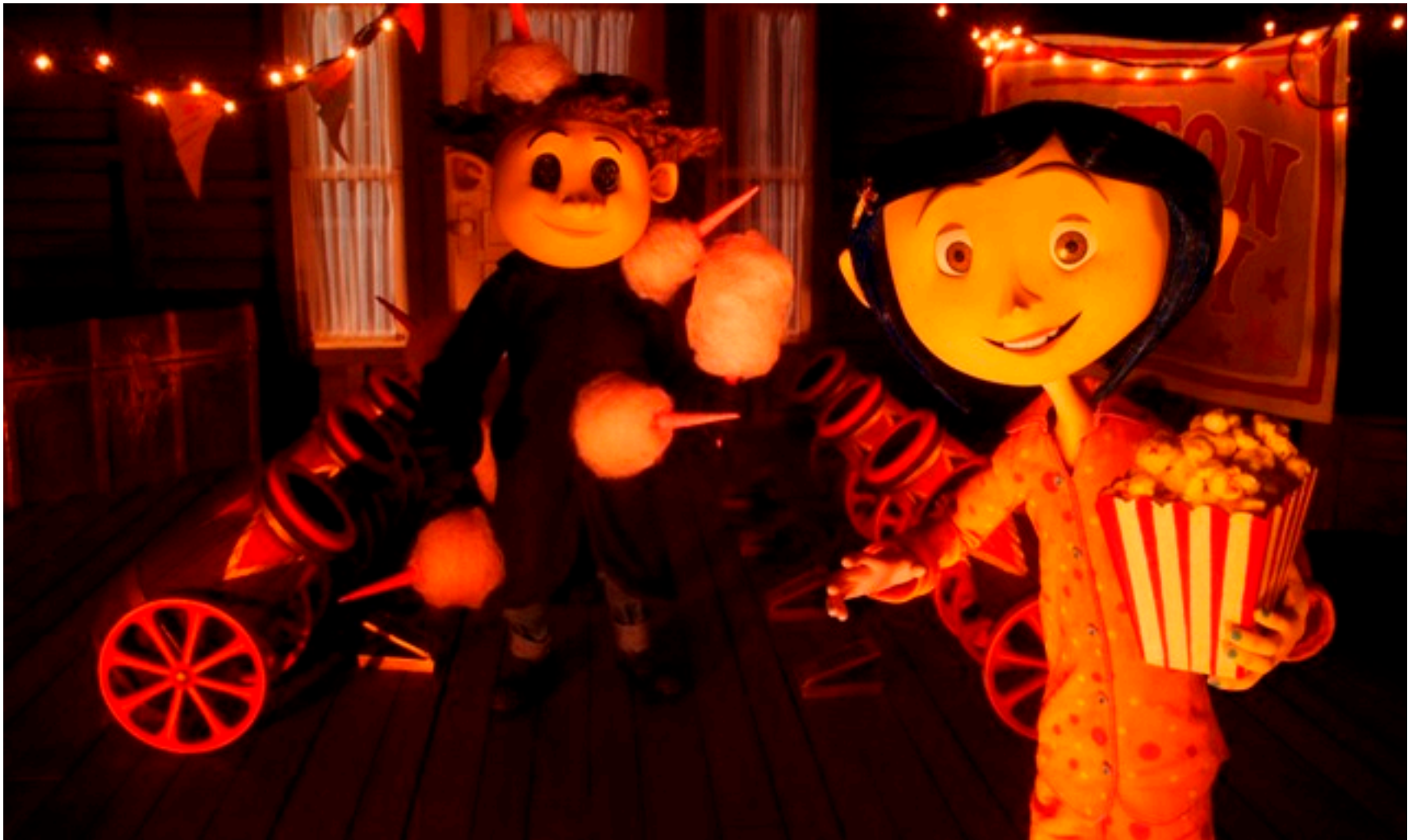
Coraline was released on Blu-Ray on July 21st, 2009.

Nothing gets old about “Coraline”. Actually, it gets richer with each viewing. That’s the mark of a great movie and exactly what most buyers willing to pay the still-too-steep purchase price of most Blu-Ray releases are looking for - something to watch again and again. You’ll watch “Coraline” again and again.