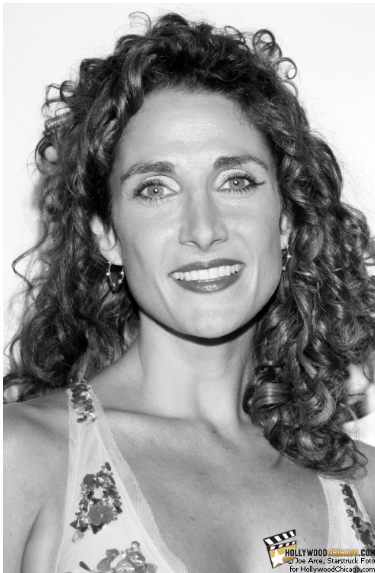
Melina Kanakaredes at the Gabby Awards, Chicago, June 19, 2009