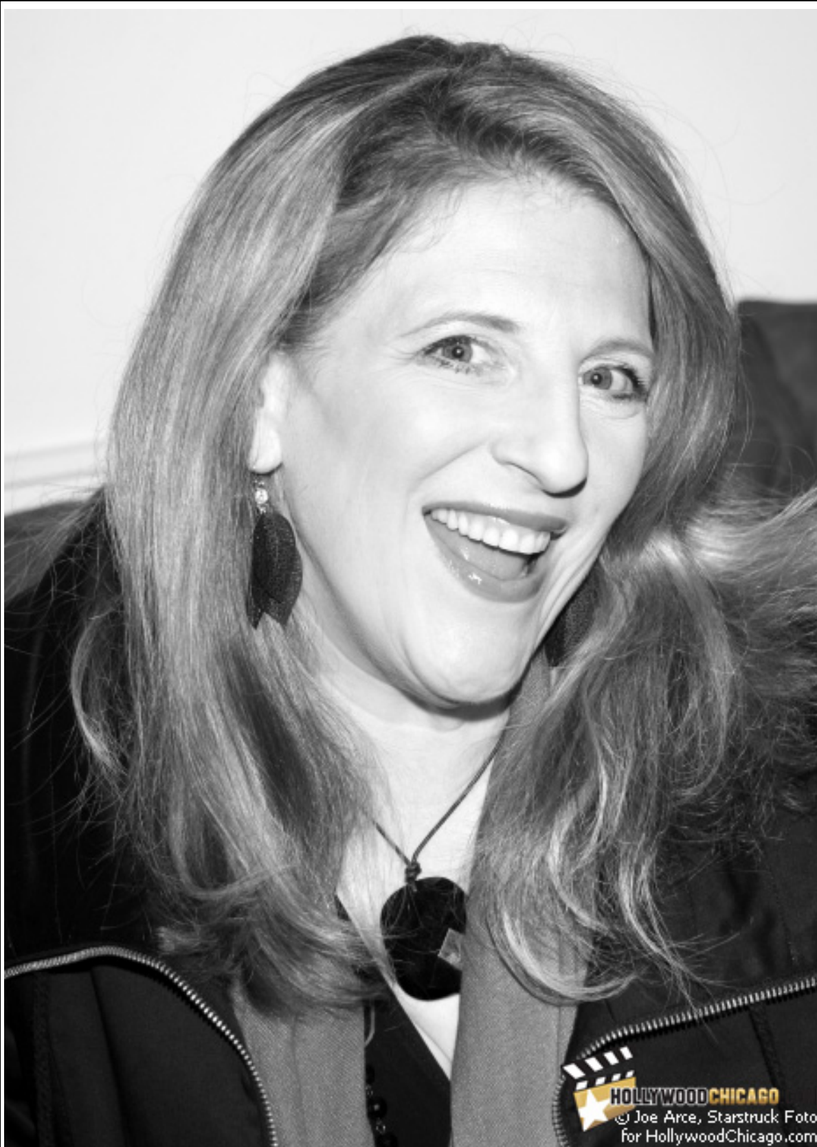
Lisa Lampanelli in Chicago, June 20, 2009. READY: Smiling and greeting