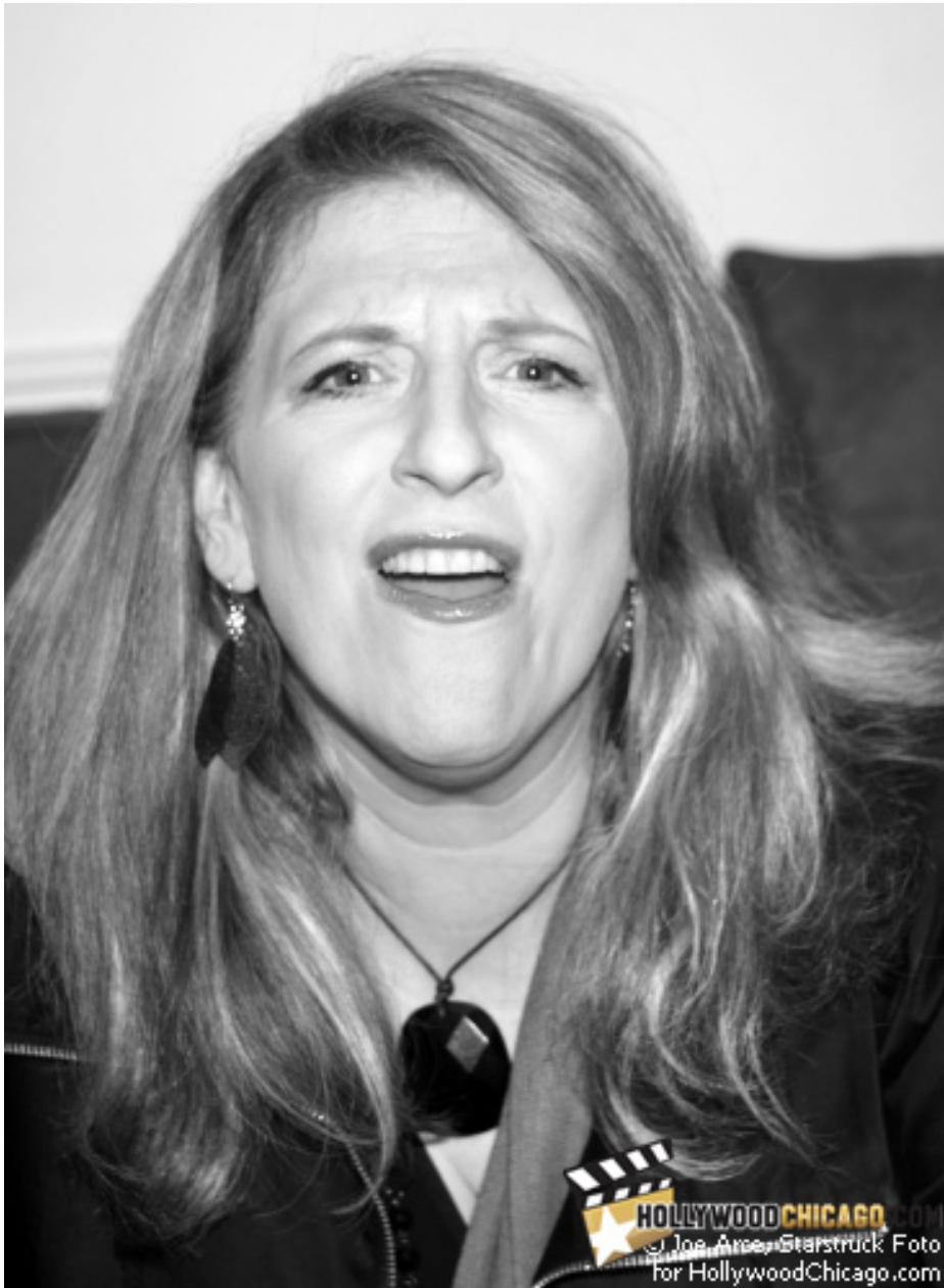
FIRE: Lethal Barrage When Comic Sharks Attack

Lisa is now very depressed that she didn't see "Jimmy". It is now HC theater critic Alissa Norby's turn to ask the one question.