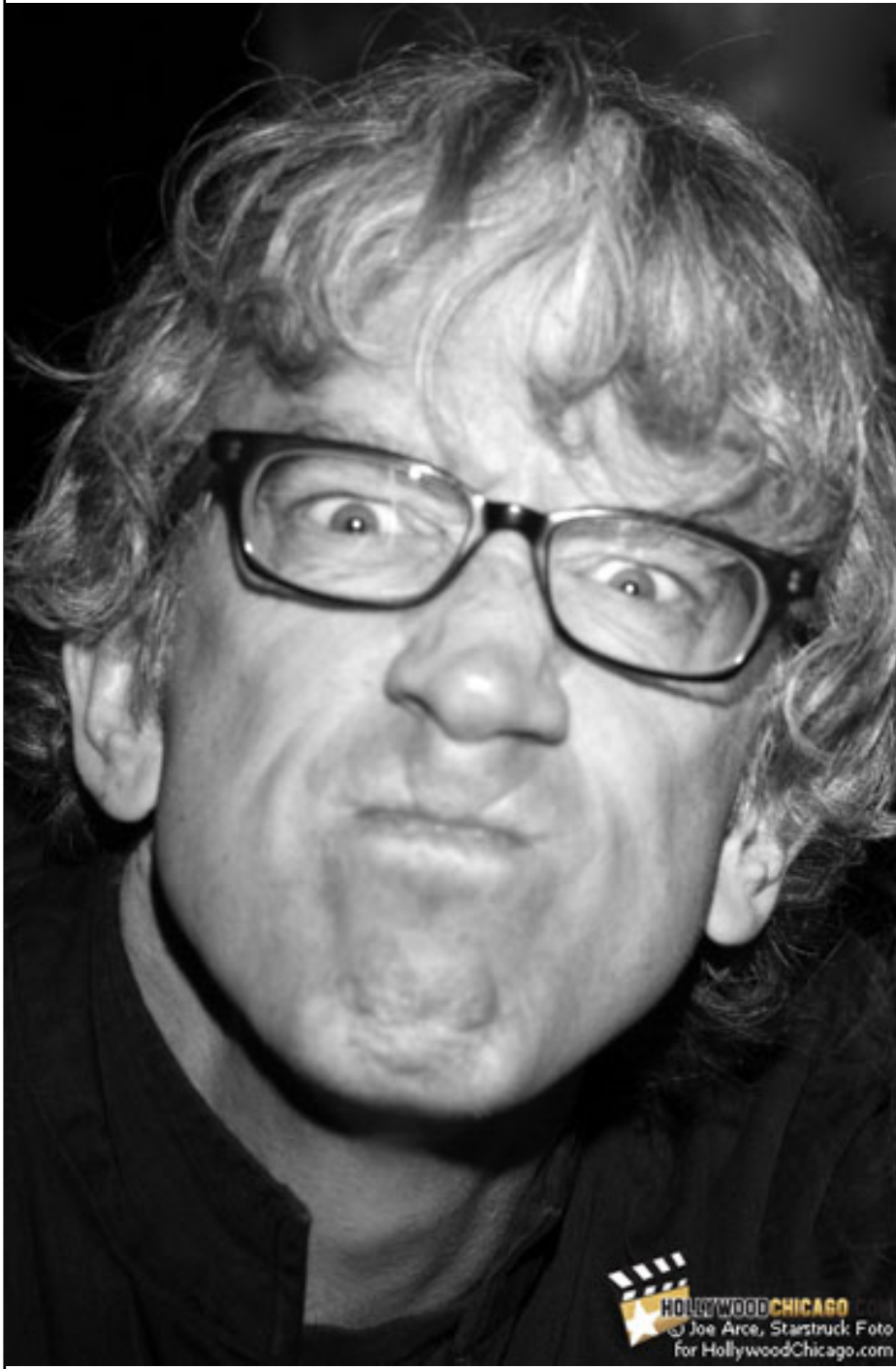
Andy Dick in Chicago on June 18, 2009