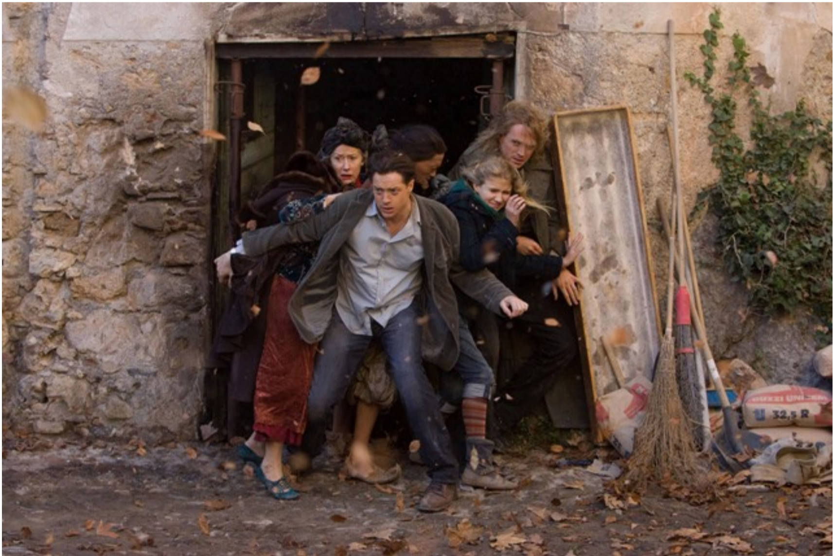
Inkheart was released on Blu-Ray on June 23rd, 2009.

I have no doubt that Cornelia Funke’s book on which the film “Inkheart” is based is an entertaining, young-adult read. But the drive for every studio to find the next Harry Potter-esque franchise has led to a few adaptations that probably should have stayed on the printed page. What can be left to a reader’s vivid imagination doesn’t always translate to the reality of cinema.