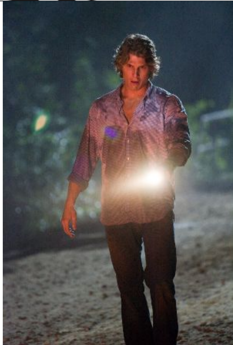
Friday the 13th was released on Blu-Ray on June 16th, 2009.