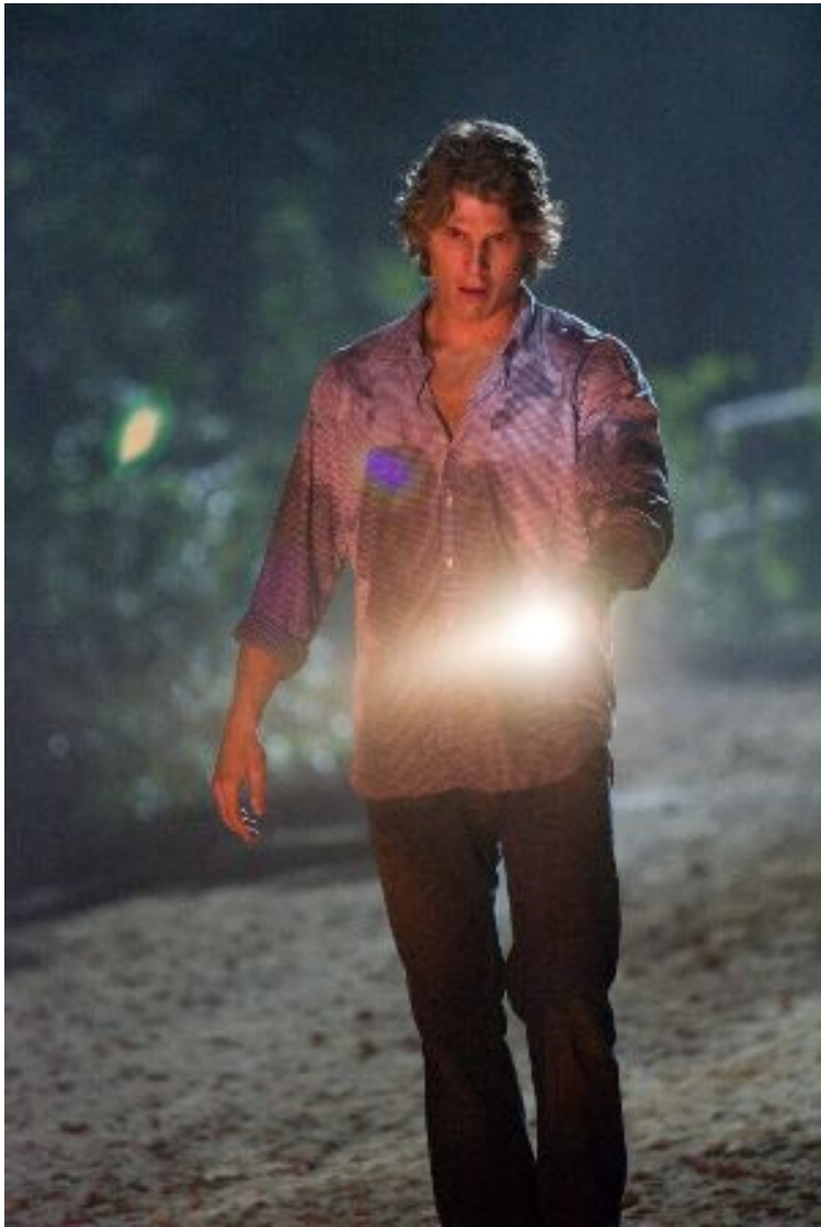
Friday the 13th was released on Blu-Ray on June 16th, 2009.