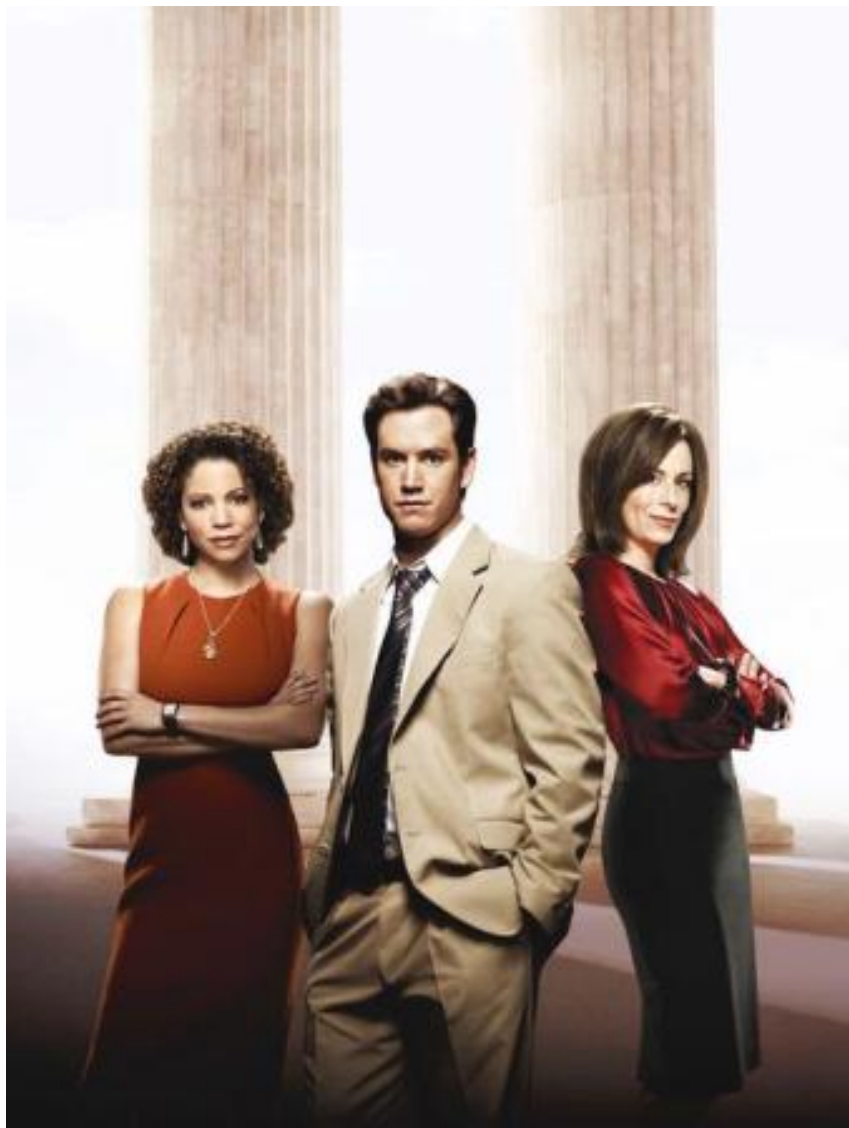
Gloria Reuben, Mark-Paul Gosselaar and Jane Kaczmarek