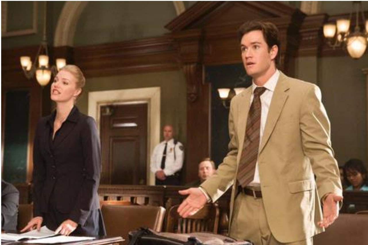
Melissa Sagemiller and Mark-Paul Gosselaar

I've always had a problem with shows that feel like they intentionally set out to "make a difference". Good television starts with characters first and difference-making messages come from them. You can't write theme. Write plot and let theme come organically from the plot. "Raising the Bar" is ALL theme and all message.