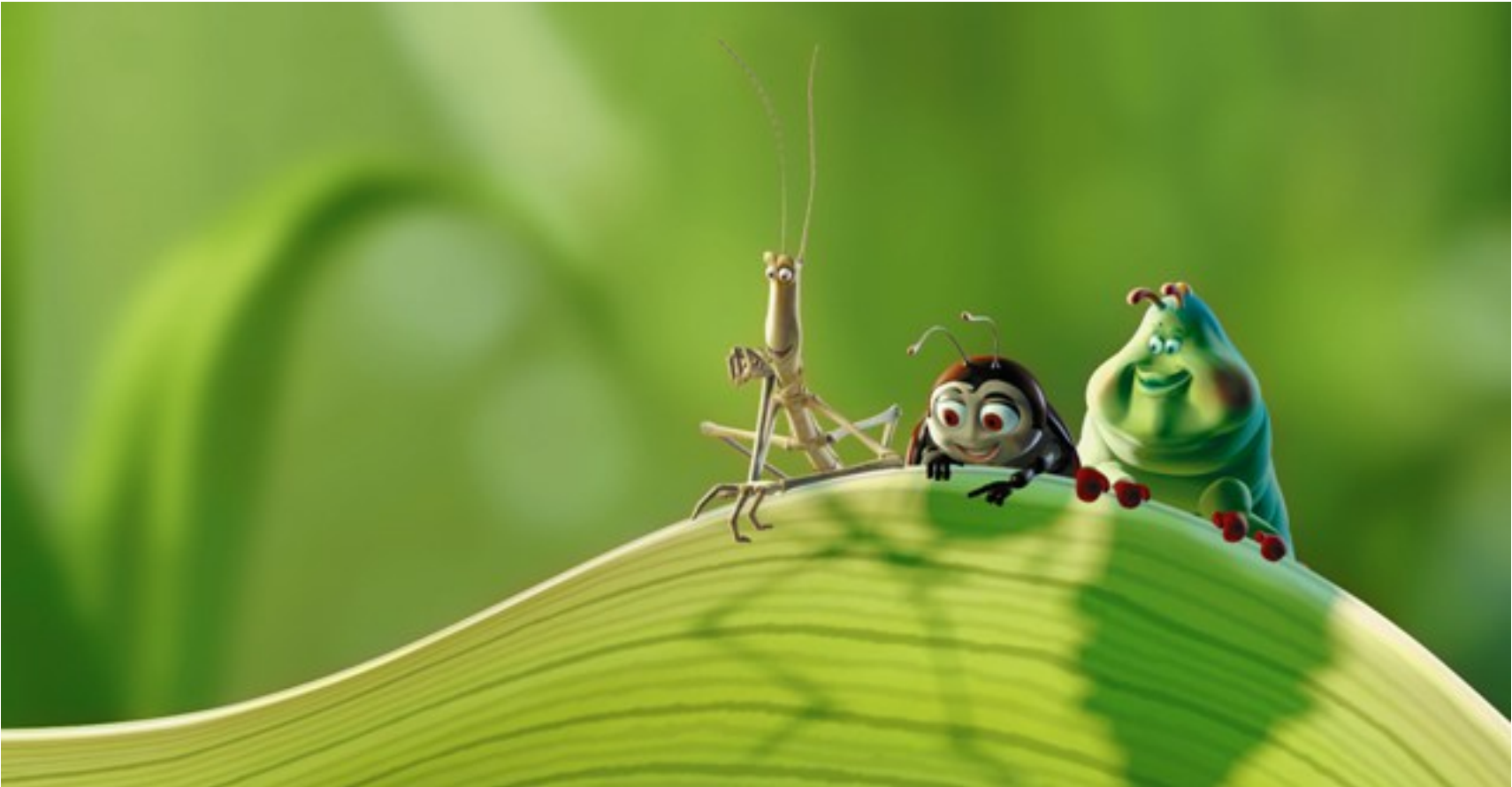
A Bug’s Life was released on Blu-Ray on May 19th, 2009.

With this week’s release of the fantastic “ Up [19],” Pixar is back in the cinematic conversation. With Pixar back in the spotlight, go back to one of their earliest films, the underrated “A Bug’s Life,” a film that has held up surprisingly well in the decade since its release.