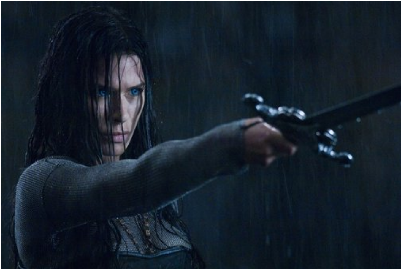
Underworld: Rise of the Lycans was released on Blu-Ray on May 12th, 2009.

How many people were really concerned with how the blood feud started between the vampires and the lycans that served as the foundation for the Kate Beckinsale “Underworld” films? Enough to spawn this unusual prequel, detailing the history of this centuries-old rivalry.