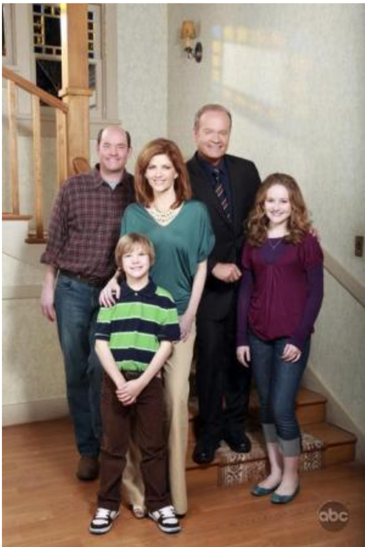
Hank