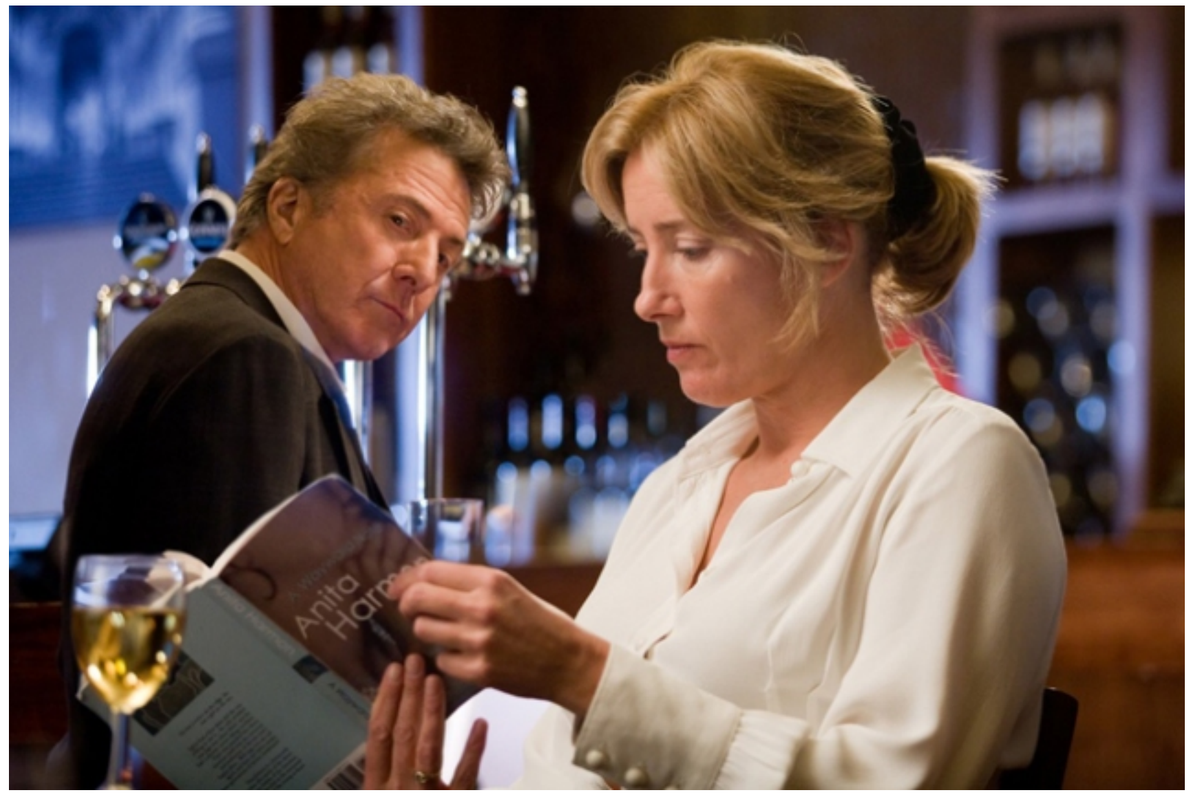
Last Chance Harvey was released on DVD on May 5th, 2009.

"Last Chance Harvey" is a simple, gentle movie that doesn't really do anything remarkable but features two performances so good that they will justify at least a rental for nearly any viewer and get them over the relatively generic screenplay. It's an old-fashioned crowd-pleaser, a totally satisfying rental on a Saturday night.