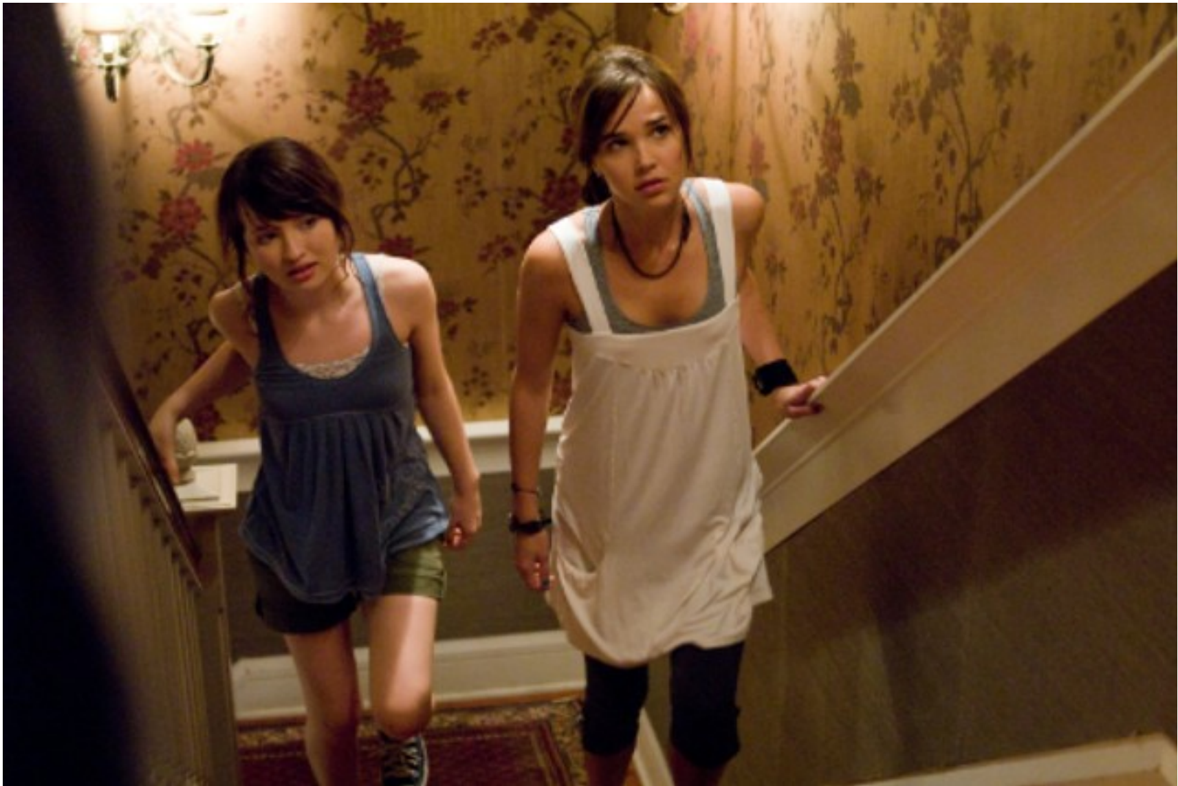
The Uninvited was released on Blu-Ray on April 28th, 2009.

I’ve seen a lot of Asian horror and most remakes pale in comparison, but I thought I’d try something new with “The Uninvited,” now available on Blu-Ray and DVD. I thought perhaps I was romanticizing my brief obsession with those original films when I had to review remakes like the “The Grudge,” “Pulse,” “The Eye,” and “Shutter” and thought I should do an original-remake double feature this time. BIG mistake.