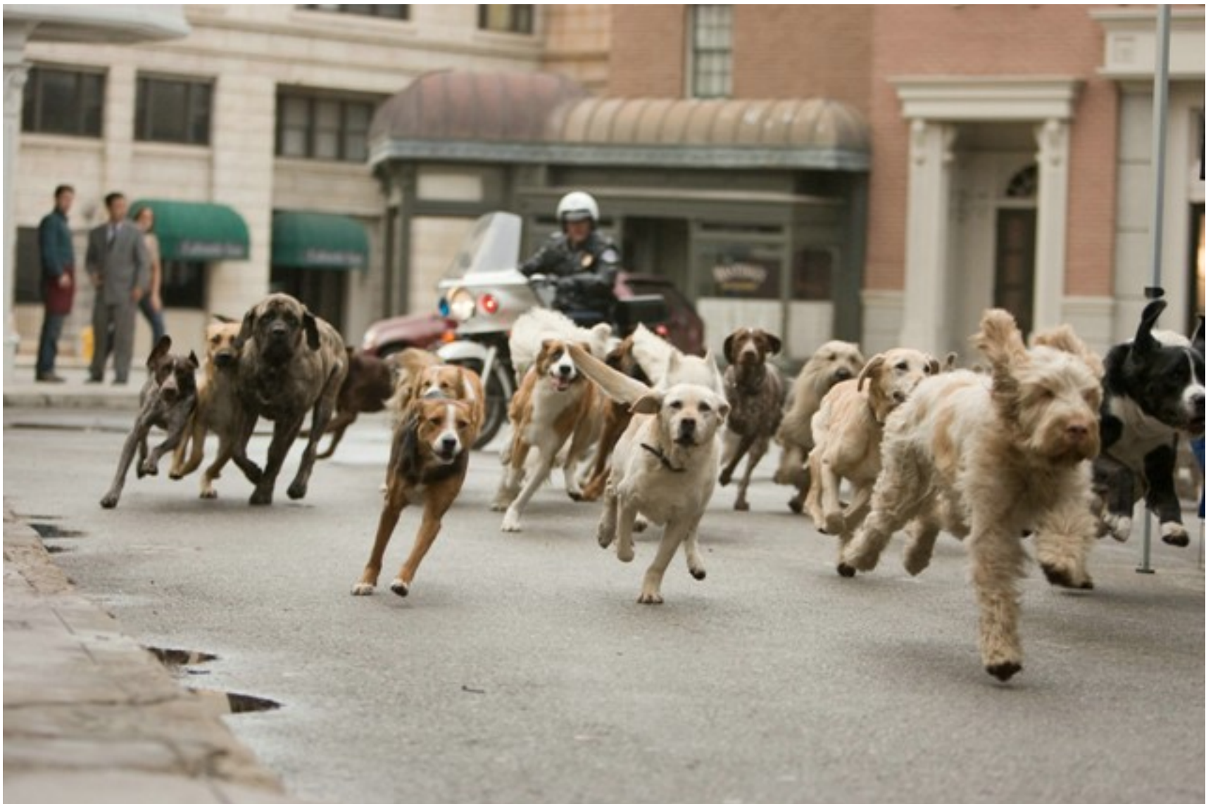
Hotel For Dogs was released on Blu-Ray on April 28th, 2009.

“Hotel For Dogs” should have been better. It’s predictable, a little dull, too slapsticky, and not as clever as one would hope, but this is essentially popcorn fare for kids. Judged on that level, “Hotel For Dogs” is cute, charming, well-acted, and sweet. Yes, there are WAY too many goofy dog montages like bulldogs on treadmills (easier than walking them) but the young cast is effective and the entire film is much cuter than a lot of its canine brethren.