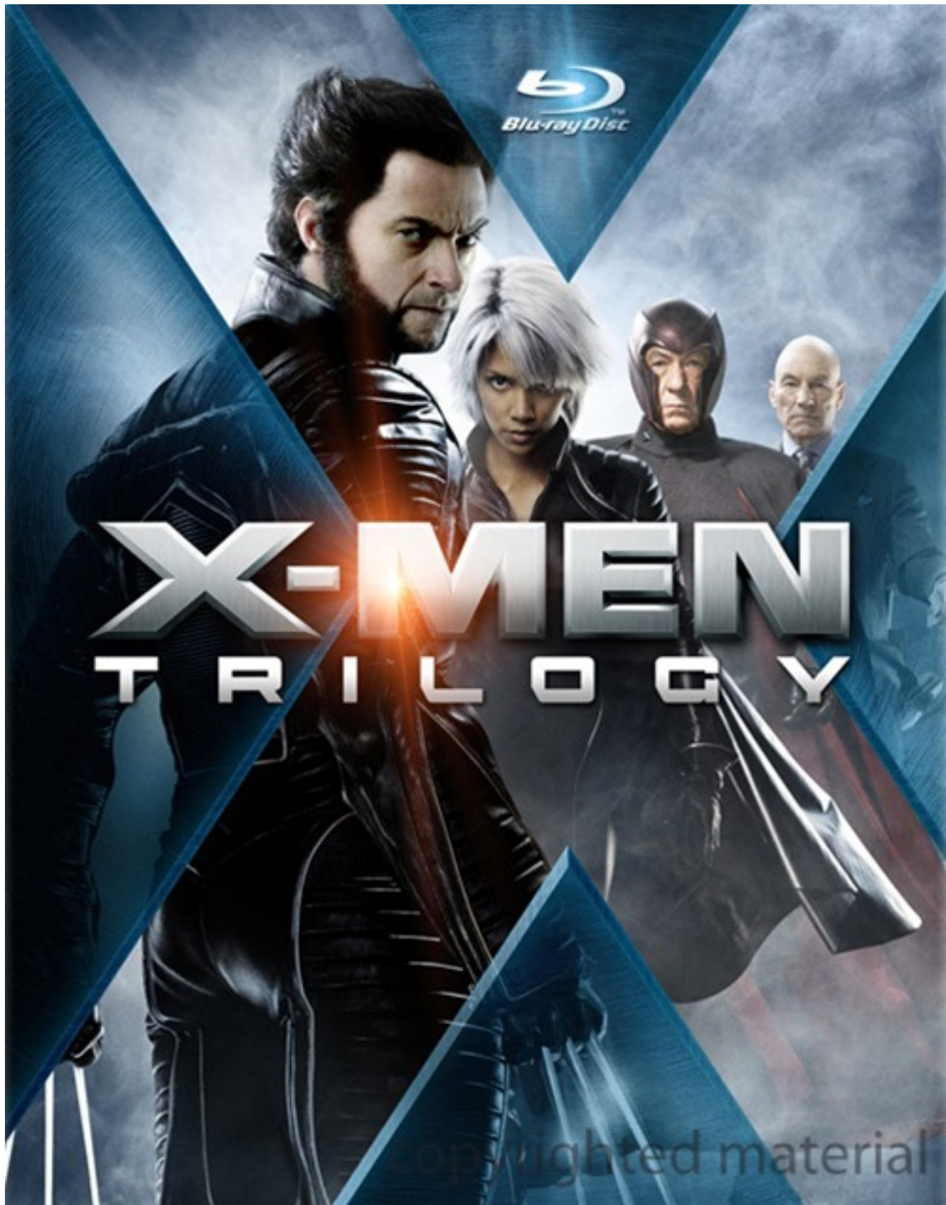
X-Men Trilogy was released on Blu-Ray on April 21st, 2009.

Knowing the rabid fan base of the franchise, Twentieth Century Fox has released a very complete set. Want special features? There are hours of them. Digital copies? There’s one for each film. And each film is presented in HD for the first time (the first and third film are presented in 2.40:1 with the middle film in 2.35:1). All three films are accompanied by 5.1 DTS-HD Master Audio English tracks and 5.1 Dolby Digital tracks in Spanish, French, and Portuguese.