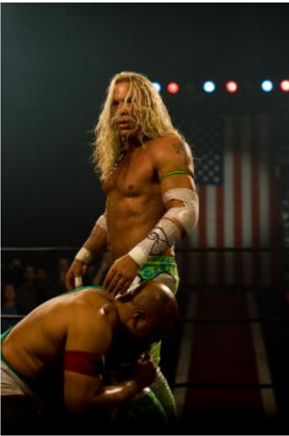
The Wrestler was released on Blu-Ray on April 21st, 2009.

I’m struck a little bit by the paucity of the special features on “The Wrestler”. I have a feeling that in ten years, hardcore fans of this movie are going to be quoting it verbatim. It is one of the most widely adored films of the last few years and a movie I get asked about nearly as much as any other from 2008. With that kind of rabid fan base, couldn’t Fox do better than two featurettes and a music video?