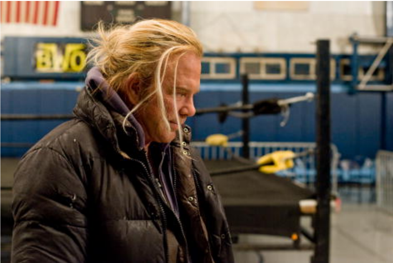
The Wrestler was released on Blu-Ray on April 21st, 2009.

His speech would have been legendary, but Rourke not winning the Oscar for “The Wrestler” may have been the best thing that could have happened to the film. It keeps the actor, the movie, and the character as the beloved underdog everyone wants them to be. No one roots for the winner. The idea that the Academy got it wrong, not only in their choice of Sean Penn [12] over Rourke for Best Actor but in ignoring the film in other major categories like Director and Picture will only add to the allure of the film over the years. It’s going to be a prime example of where the Academy went wrong in a lot of fan’s eyes. Randy “The Ram” got screwed again.