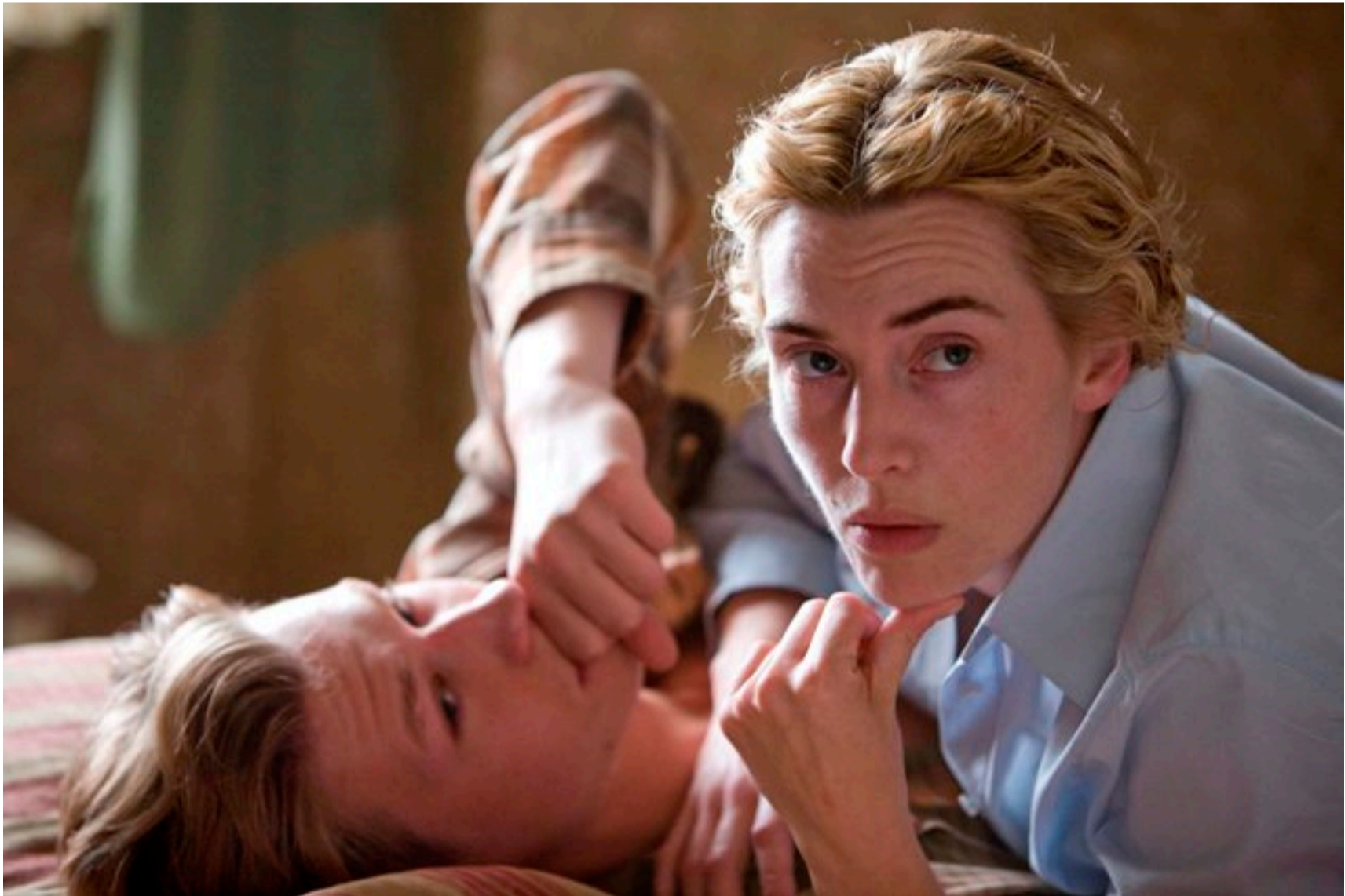
The Reader will be released on Blu-Ray on April 28th, 2009.

Watching the film again on Blu-Ray, I have three thoughts about the actual movie, now that it can be viewed outside of the awards season. One, Kate Winslet should have always been in lead. She’s the heart of the film and in over an hour of its total running time. How could you possibly compare that to something like Viola Davis [14]’ ten minutes of work in “ Doubt [15]”?