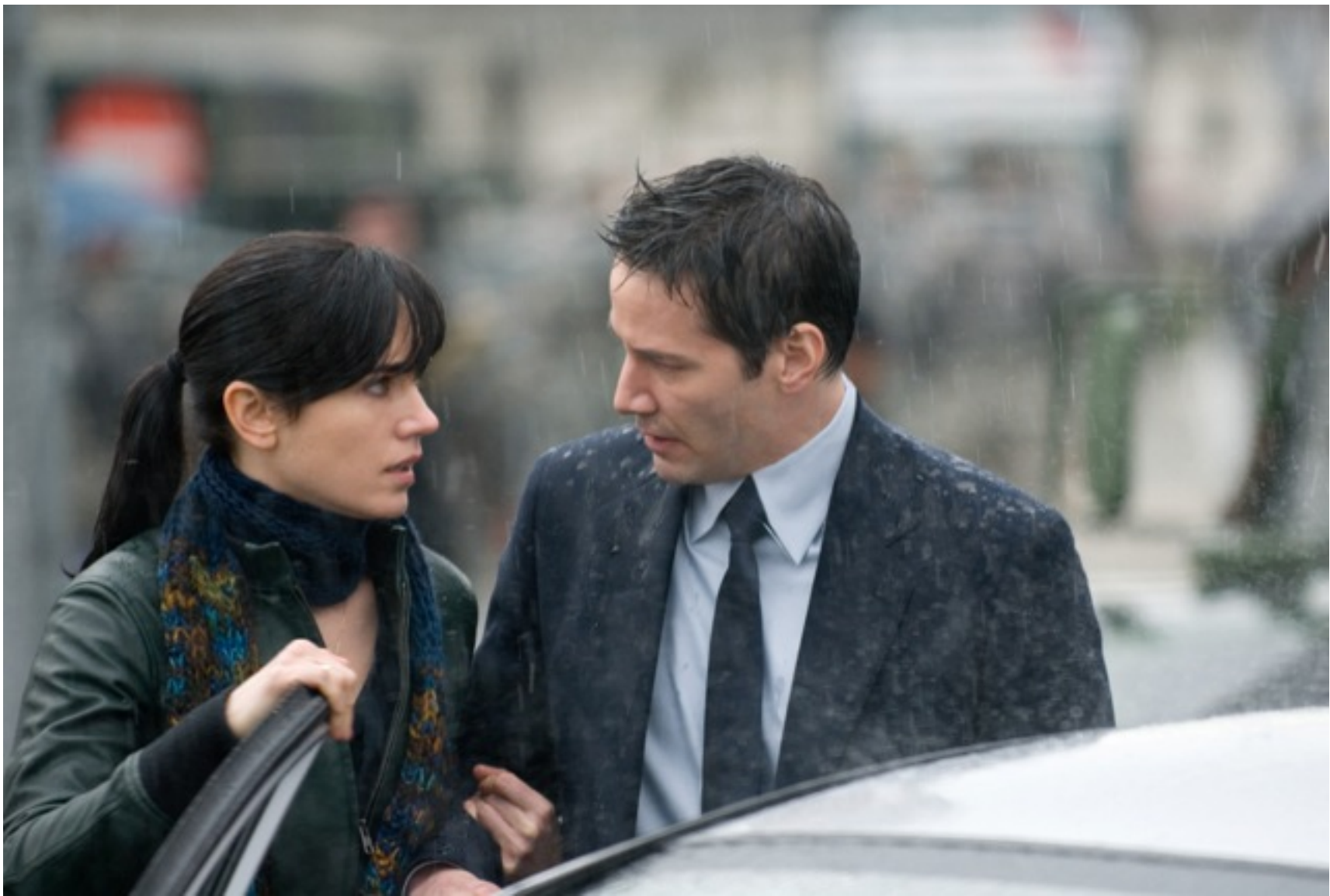
The Day the Earth Stood Still was released on Blu-Ray on April 7th, 2009.

Where does the remake of the classic 1951 sci-fi film go wrong? Where do I start? Well, the original was a plea for peace, a hope for human understanding and compassion in an increasingly dangerous world. There’s absolutely no reason that a modern filmmaker couldn’t make a contemporary update of that message. We clearly still need to consider rational thought over reactionary violence.