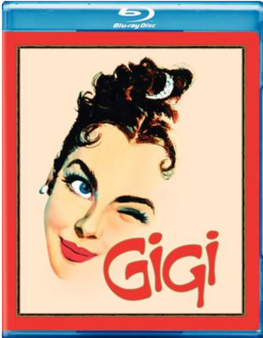
Gigi was released on Blu-Ray on March 31st, 2009.

If I had to pick one of the new WB classic movie musical release, it would easily be “An American in Paris,” but “Gigi” has its charms too and the HD special edition is just as remarkable.