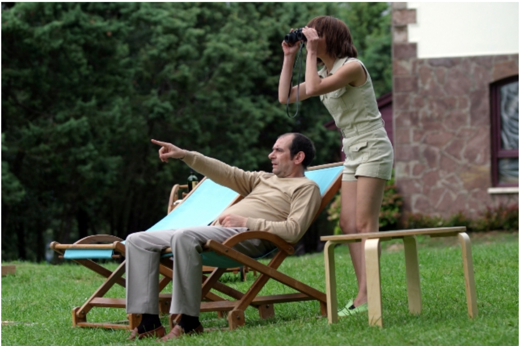
Timecrimes was released on DVD on March 31st, 2009.

“Timecrimes” is a movie likely to put a broad smile on the face of sci-fi or horror nuts grown weary of the cavalcade of crap produced by their favorite genres. Writer/director Nacho Vigalondo has crafted what is almost an oxymoron - a simple time-travel movie. So many time travel movies get deep into chaos theory or the butterfly effect, but “Timecrimes” is a piece with only four characters that delves into the idea of moving back in time.