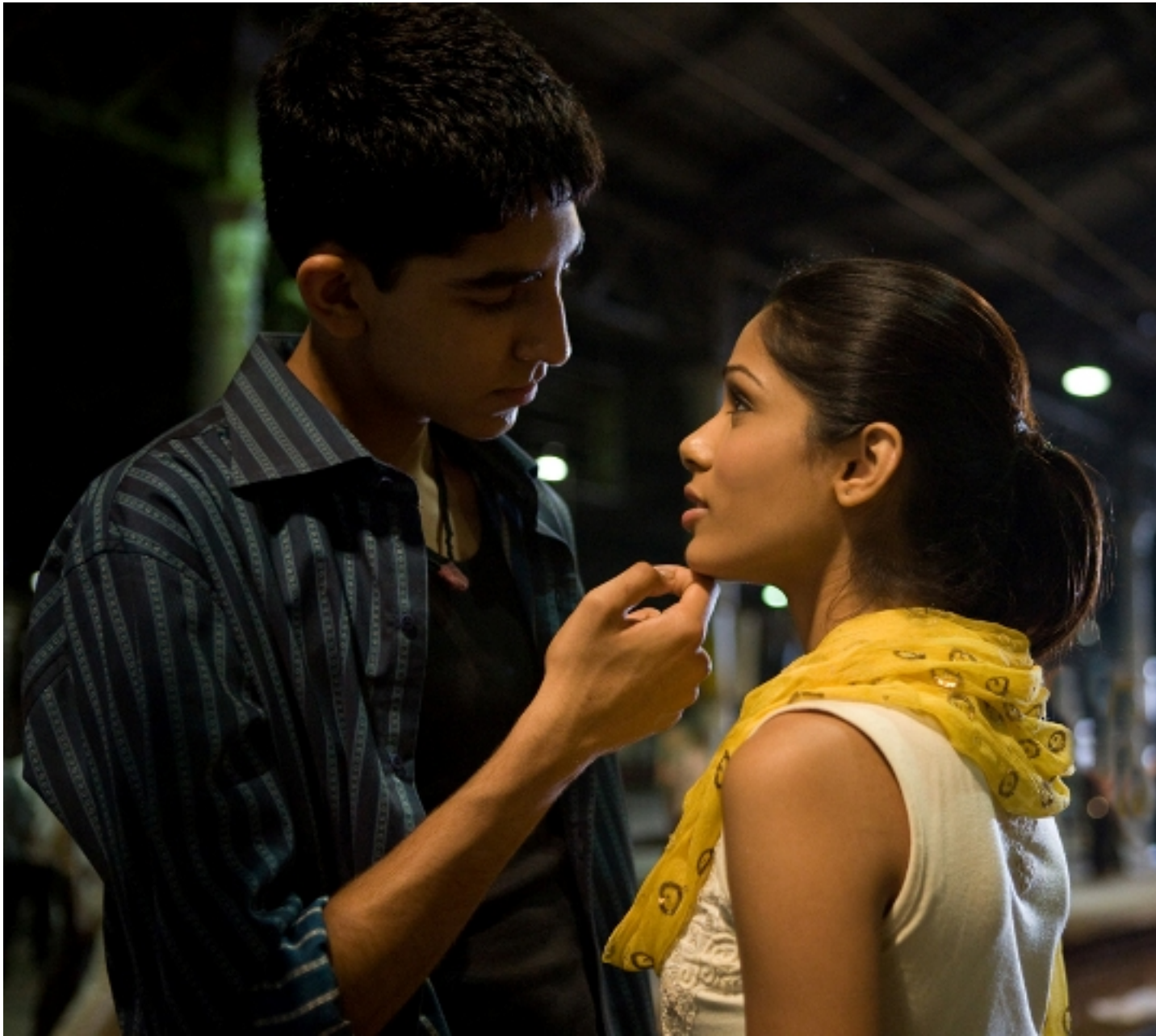
Slumdog Millionaire will be released on Blu-Ray on March 31st, 2009.