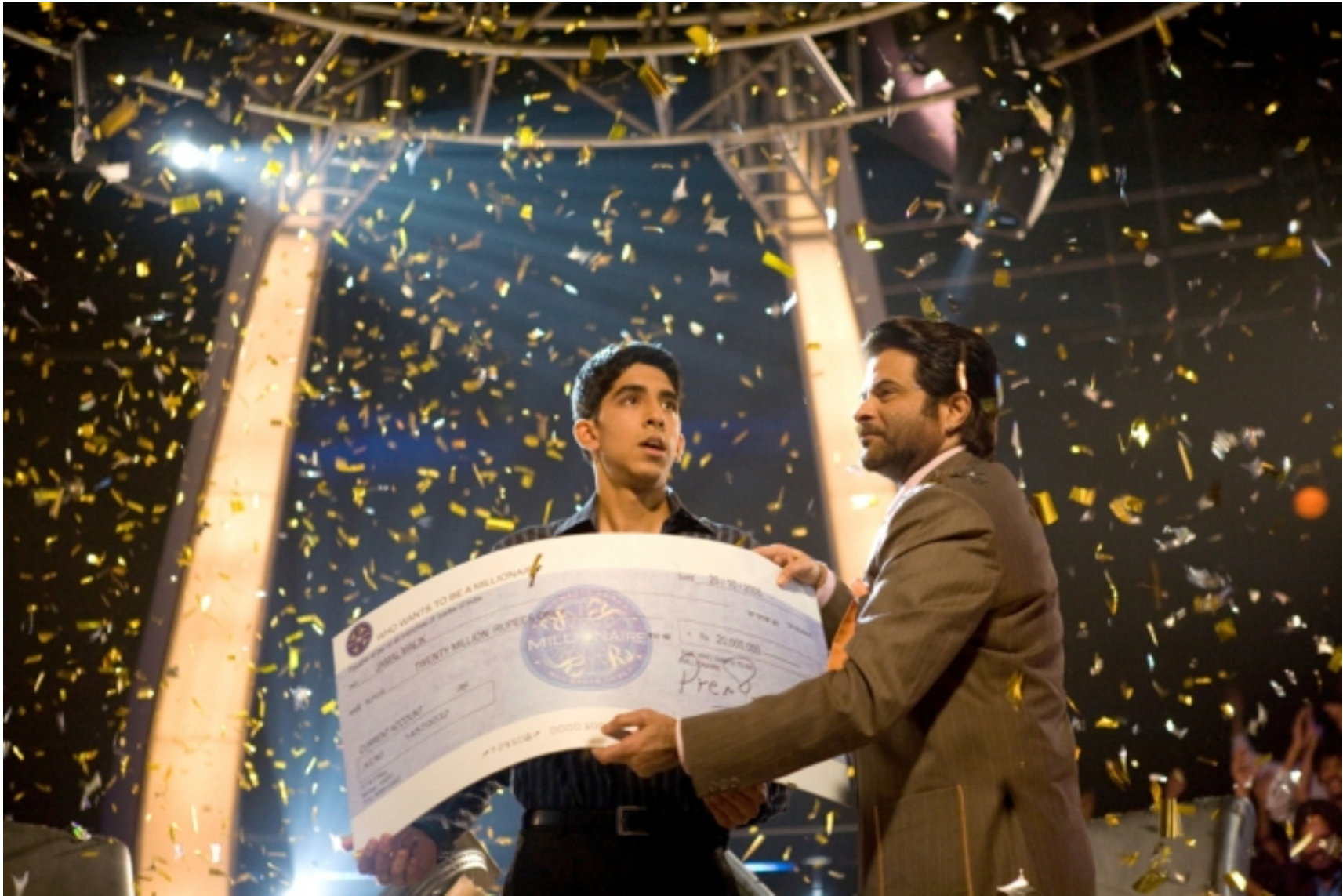
Slumdog Millionaire will be released on Blu-Ray on March 31st, 2009.

What more is there to say about “Slumdog Millionaire”? One of the most award-winning films of all time, the Danny Boyle [5]-directed fairy tale took home eight Oscars [13], including prizes for Best Cinematography, Best Editing, Best Adapted Screenplay, Best Score, Best Director, and Best Picture. It was not just one of the most acclaimed films of 2008, it is one of the most acclaimed films of the ’00s.