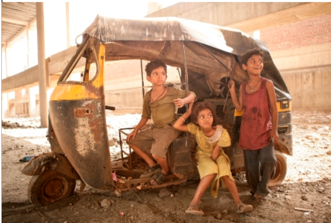
Slumdog Millionaire will be released on Blu-Ray on March 31st, 2009.

The special features on “Slumdog Millionaire” include: