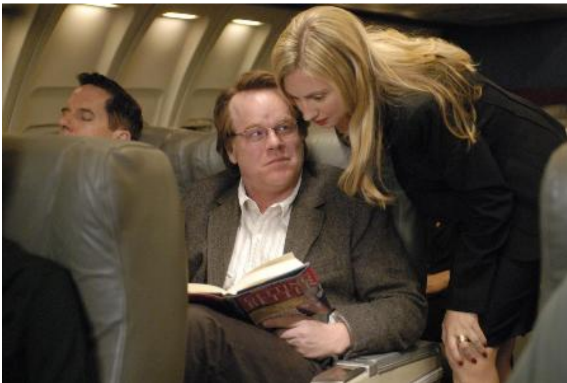
Synecdoche, New York was released on Blu-Ray on March 10th, 2009.

Of course, all of this makes it into the “play,” with Caden eventually having to cast someone to play himself ( Tom Noonan [15]) and even Hazel ( Emily Watson [6]). The line between theater and reality dissolves and you start to wonder if Caden isn’t experiencing a dream sequence or perhaps you are.