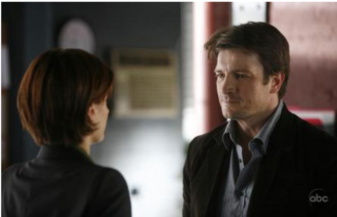
Stana Katic and Nathan Fillion in Castle.

Castle has a boozy mother ( Susan Sullivan [16]) and intellectual daughter ( Molly C. Quinn [11]) and both will clearly play roles in future plots. Right now, they feel like characters we’ve seen too many times before but the two actresses are good enough to turn them into something more. Time will tell.