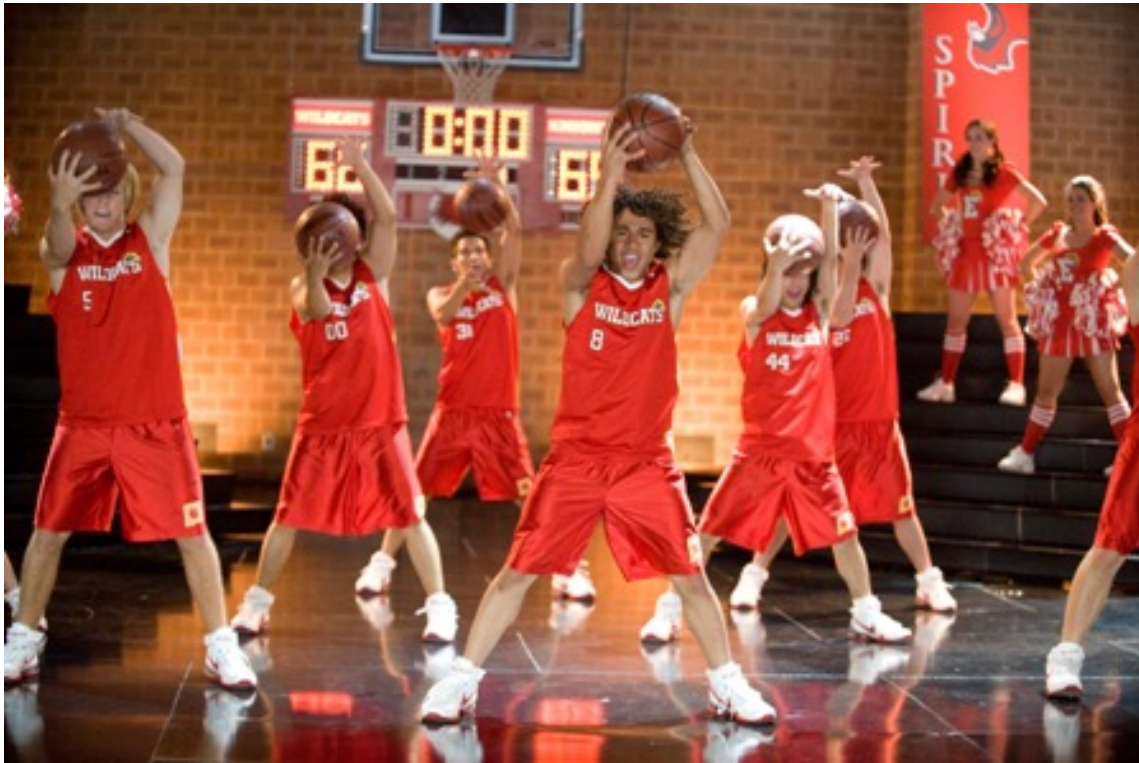
Corbin Bleu (center), principal dancers

Someone get the kids who think these are great musical tunes a copy of "Grease" or "Singin' in the Rain". Heck, get them "Little Shop of Horrors" for that matter. The final number is impressively toe-tapping, but the rest are surprisingly forgettable. Even after a reprise.