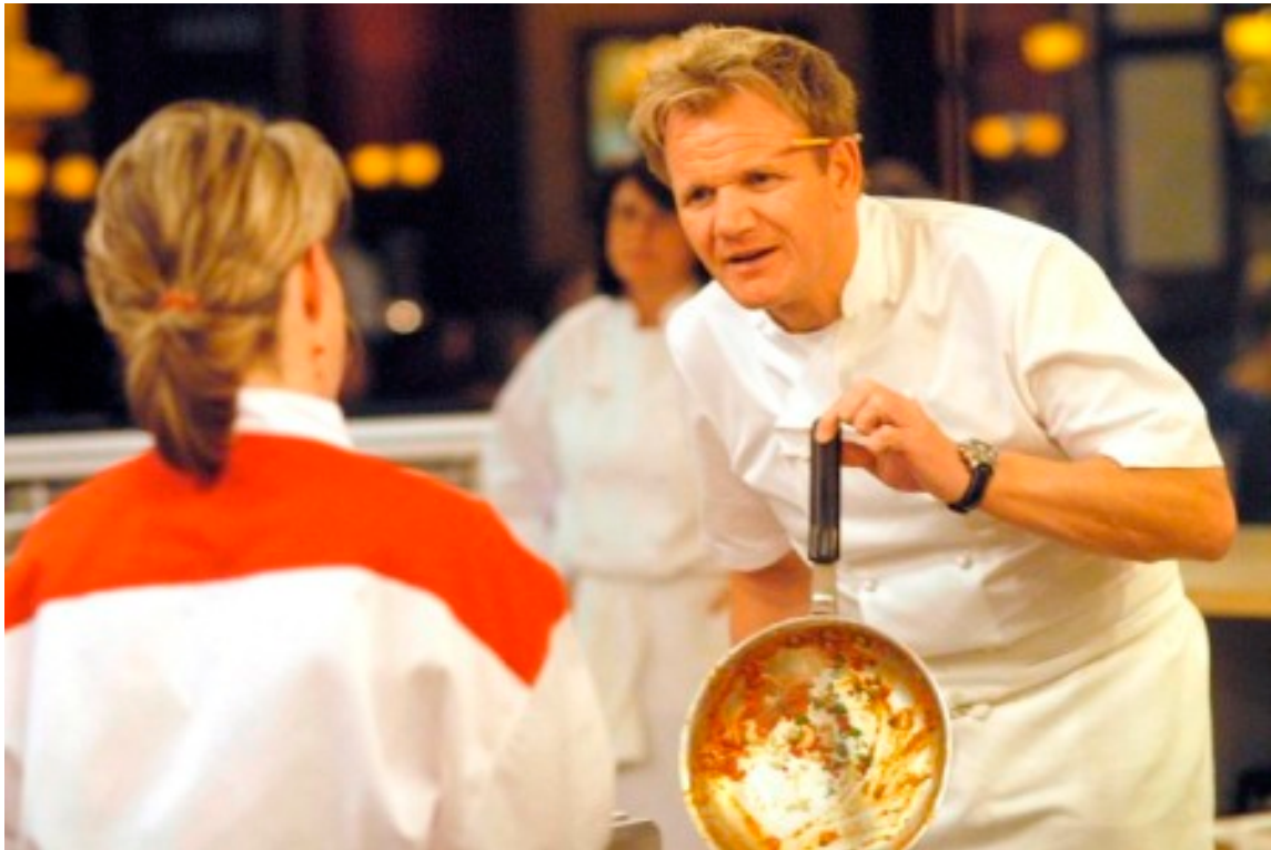
Hell's Kitchen: Chef Gordon Ramsay turns up the heat in season 5 of Hell's Kitchen premiering Thursday, Jan. 29 (9:00-10:00 PM ET/PT) on FOX.

Of course, like so many people who watch “Idol” to see Simon Cowell, the real star of “Hell's Kitchen” is Gordon Ramsay. He clearly knows that he’s trying to make good television, often setting up his chefs for failure and blowing situations out of proportion. For the former, he takes the woman with the best signature dish and makes her waitress on the first night, weakening the kitchen, and he takes the most awkward guy from the male team and sends him on the floor too. Neither decision would ever make for a good night at the restaurant. But it makes for good TV.