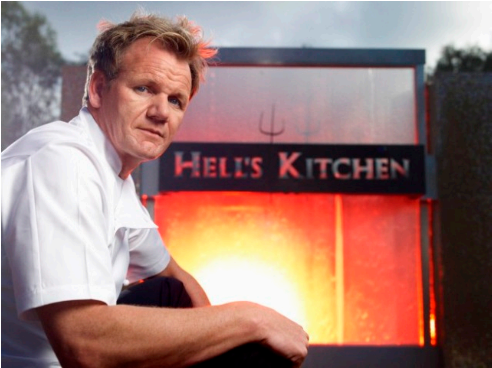
Hell's Kitchen: Chef Gordon Ramsay turns up the heat in season 5 of Hell's Kitchen premiering Thursday, Jan. 29 (9:00-10:00 PM ET/PT) on FOX.

It’s crystal clear that Fox and Gordon Ramsay are not even remotely interested in fielding the most talented team of potential chefs. That’s the goal of Bravo’s excellent “ Top Chef [9]”. “ Hell’s Kitchen [6]” is the “ American Idol [14]” auditions of cooking shows. They need two to three people who can actually cook, so they can crown a winner, but the other dozen or so wouldn’t survive a day in a high school cafeteria.