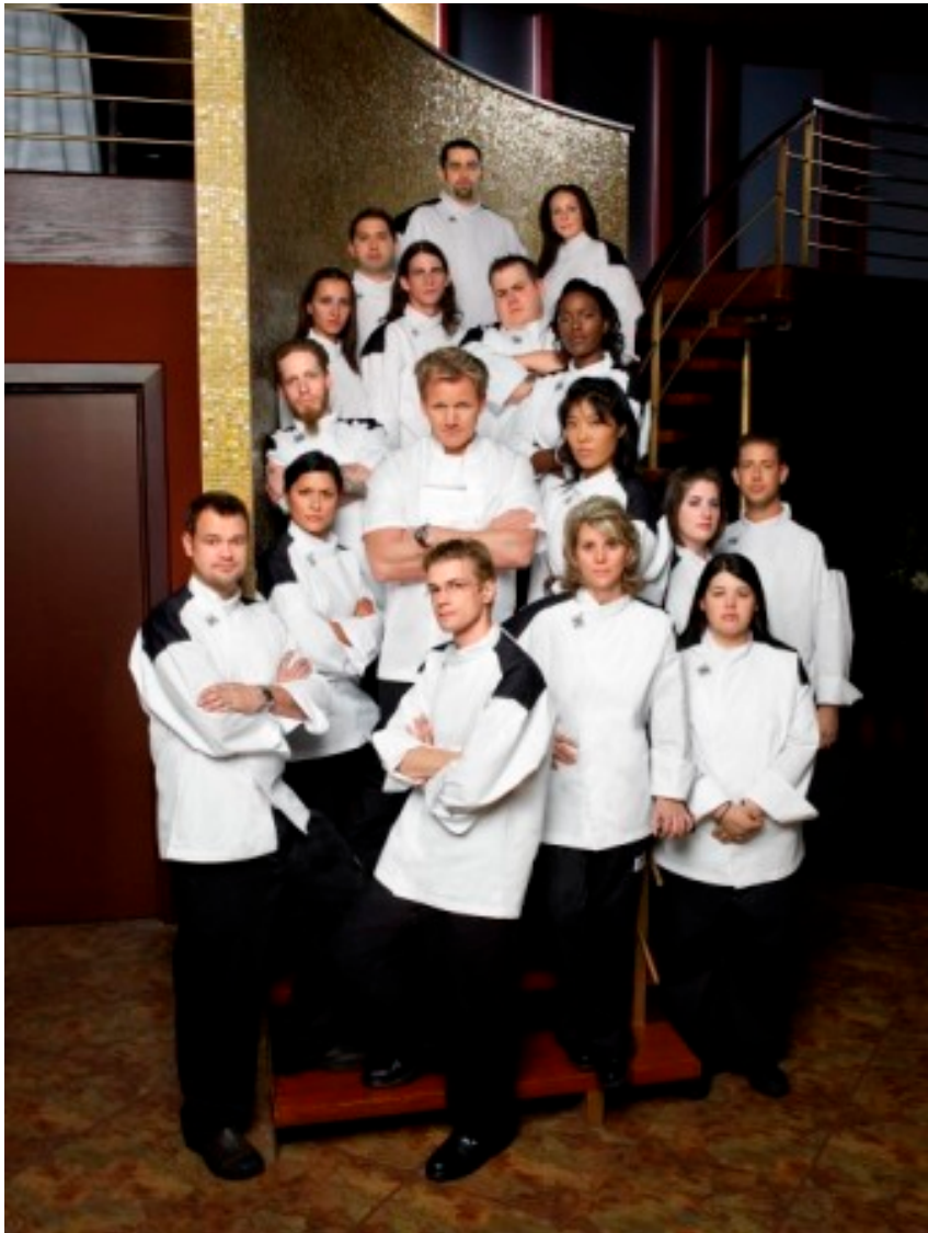
Hell's Kitchen: Chef Gordon Ramsay turns up the heat in season 5 of Hell's Kitchen premiering Thursday, Jan. 29 (9:00-10:00 PM ET/PT) on FOX.

It would be one thing if the narrator of “Hell’s Kitchen” wasn’t constantly talking about the strength of this season’s contestants and trying to sell the viewer a false bill of goods.