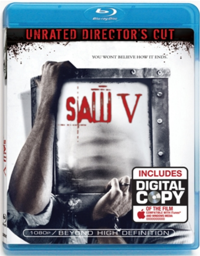
Saw V is released by Lionsgate Home Video on January 20th, 2009.

Like the “Friday the 13th” and “Halloween” franchises before it, horror produced this quickly and this ineptly has an unavoidable law of diminishing returns. It’s clearly only a matter of time before we get to “Saw VIII: Jigsaw Takes Manhattan” and then the franchise can finally come to a conclusion. (At least until the Rob Zombie of 2030 revives the “Saw” movies with a gory, new version.)