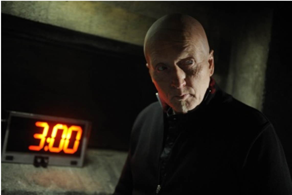
Saw V is released by Lionsgate Home Video on January 20th, 2009.

Ultimately, "Saw V" is a little better than this critic who has hated the last three films expected, but that bar could not possibly have been any lower. However, I recognize that I'm not the audience for this film and believe that people who enjoyed the first four will almost certainly be satisfied.