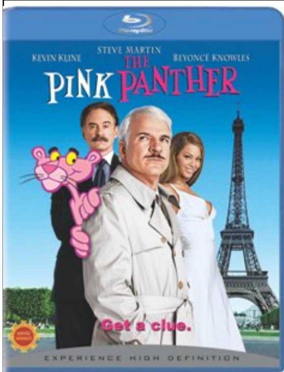
Pink Panther was released by Sony Pictures Home Video on January 20th, 2009.

The Blu-Ray version of “King Kong” makes masterful use of Universal’s U-Control feature, one of my favorite of the next-gen format. Universal understands something about the interactivity potential of Blu-Ray that other studios haven’t grasped yet. For this release, the interactivity extends to optional picture-in-picture, scene-specific featurettes, art galleries that will also display p-i-p, and BD-Live functionality that allows fans to collect clips with My Scenes and send them to friends worldwide. The film also includes an extended feature commentary with director/co-writer Peter Jackson and co-writer/co-producer Philippa Boyens.