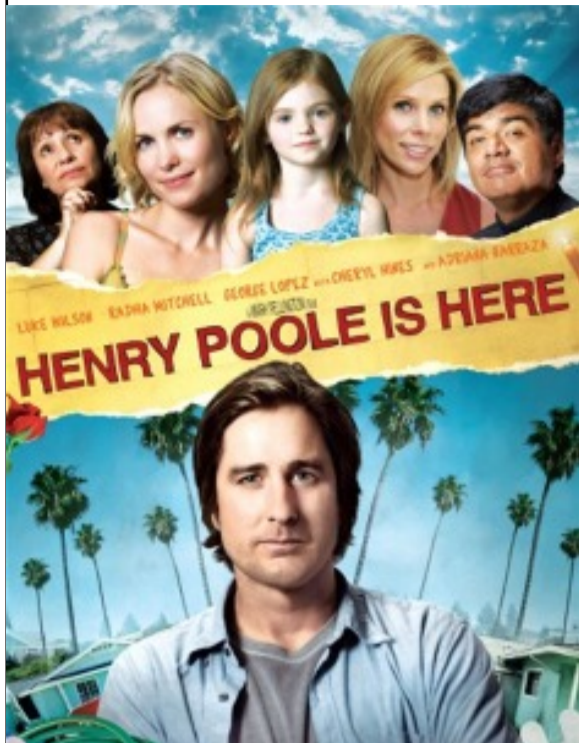
Henry Poole is Here was released by Anchor Bay Home Video on January 20th, 2009.