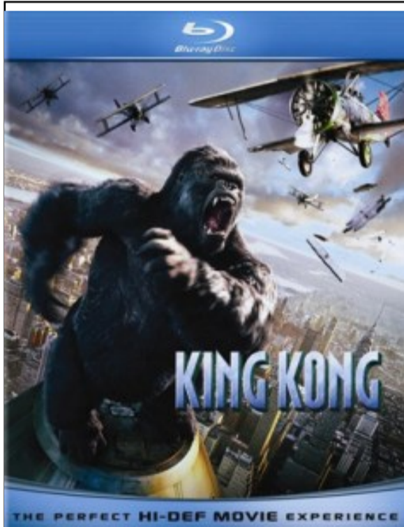
King Kong was released by Universal Home Video on January 20th, 2009.