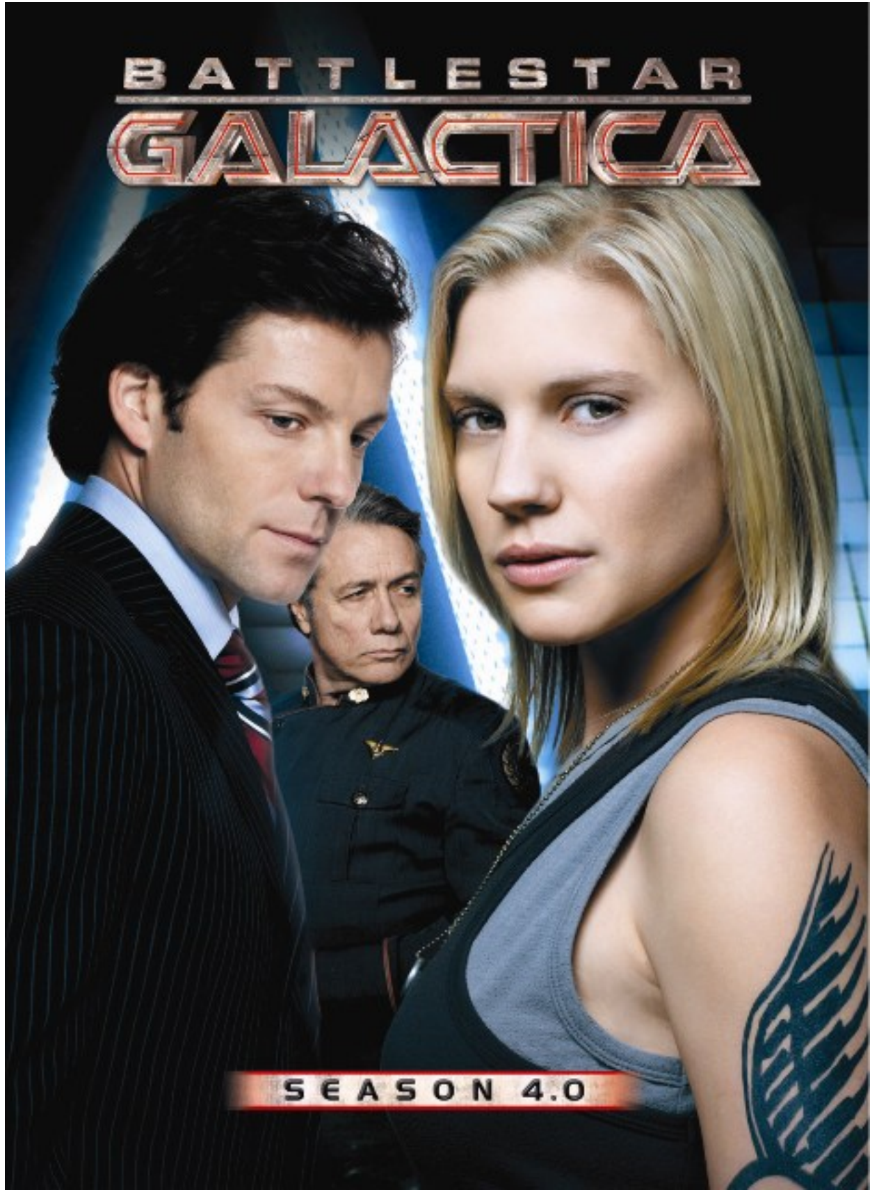
Battlestar Galactica: Season 4.0 is released by Universal Home Video on January 6th, 2009.

“Season 4.0” features ten episodes on three discs and the 101 minute movie, “Razor,” for a total of over seven hours of sci-fi goodness. In season four, the civil war amongst the Cylons has escalated and the quest for Earth continues. The fate of humanity hangs in the balance. Producers Ronald D. Moore and David Eick dropped a few hints about what to expect [19] from the conclusion of this season but you’ll want to catch up first.