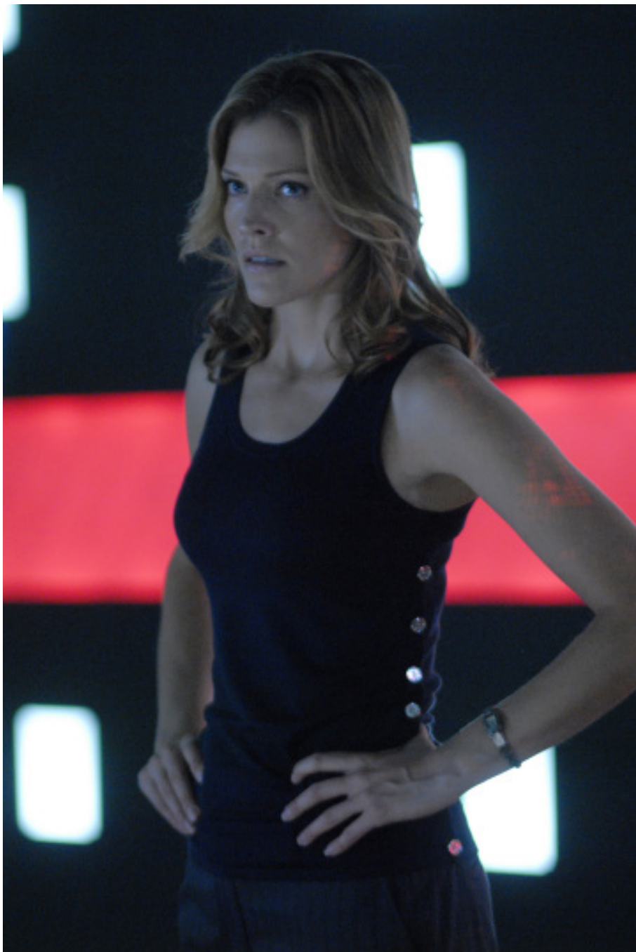
Battlestar Galactica: Season 4.0 is released by Universal Home Video on January 6th, 2009.