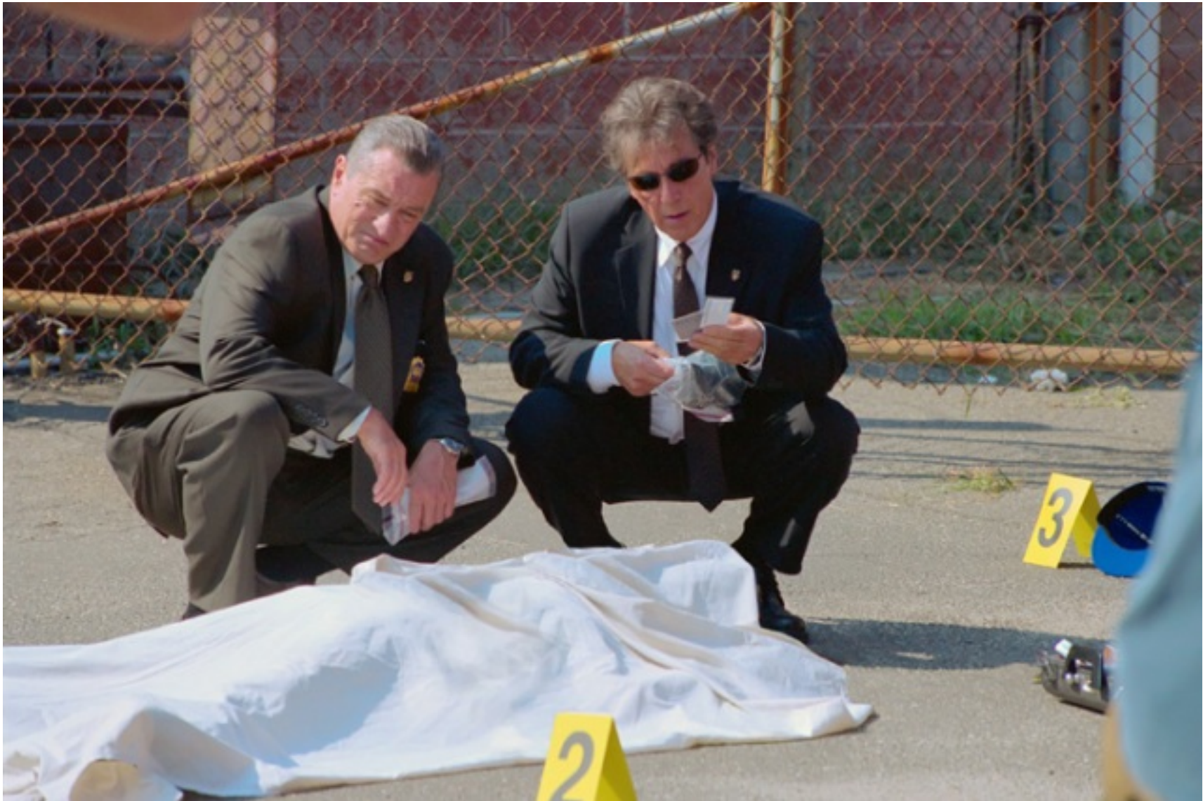
Righteous Kill is released by Anchor Bay Home Video on January 6th, 2009.

Rarely has a film seemed less a part of the New York scene, but Detectives “Turk” (Robert De Niro) and “Rooster” (Al Pacino) have allegedly been partners for 30 years in the NYPD. They’re nearly ready for retirement when one last serial killer arrives on the scene. The bad guy in question is killing people who got off due to glitches in the system that let them go without jail time. In other words, they kind of deserve it, forcing Turk and Rooster to question whether or not he should really be caught.